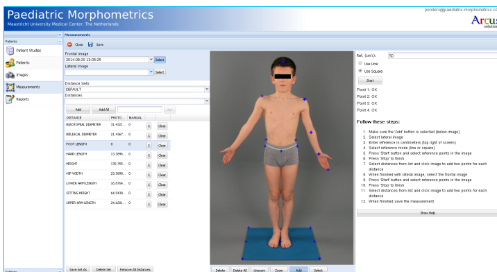
Figure 1: Measurement section of the photometry software