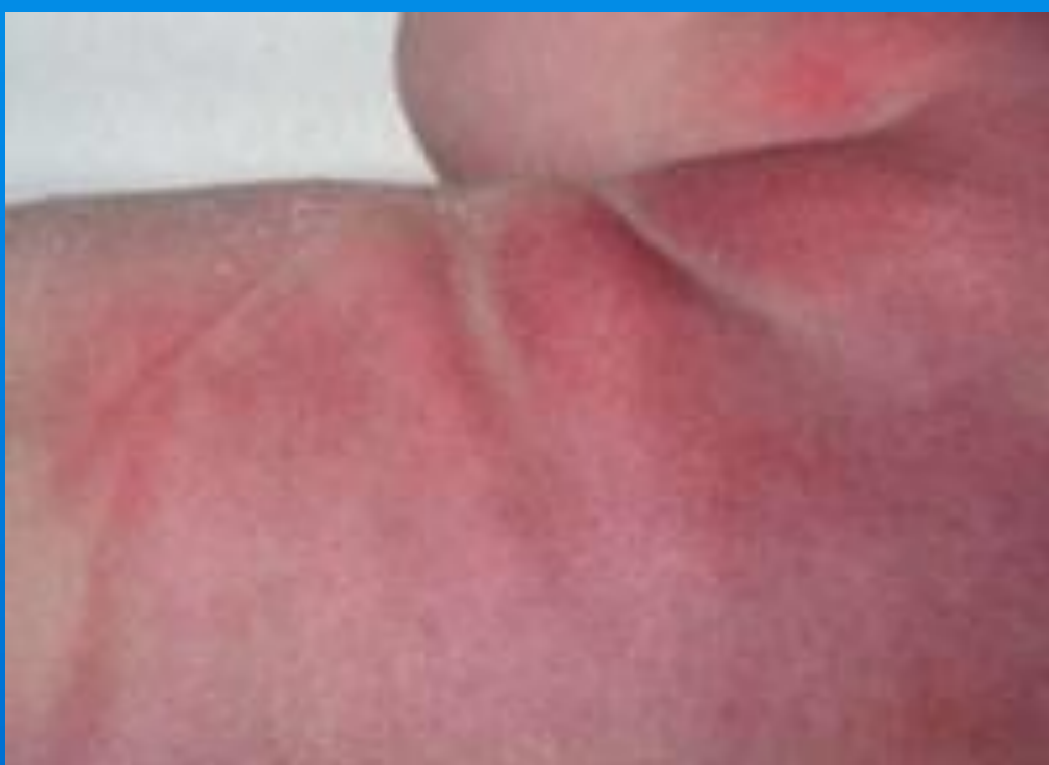
Fig 1 – Subcutaneous fat necrosis – erythematous plaques

Her bloods revealed hypercalcaemia (aCa 3.05mmol/L) and she required intravenous fluids, diuretics and low calcium milk (locasol).