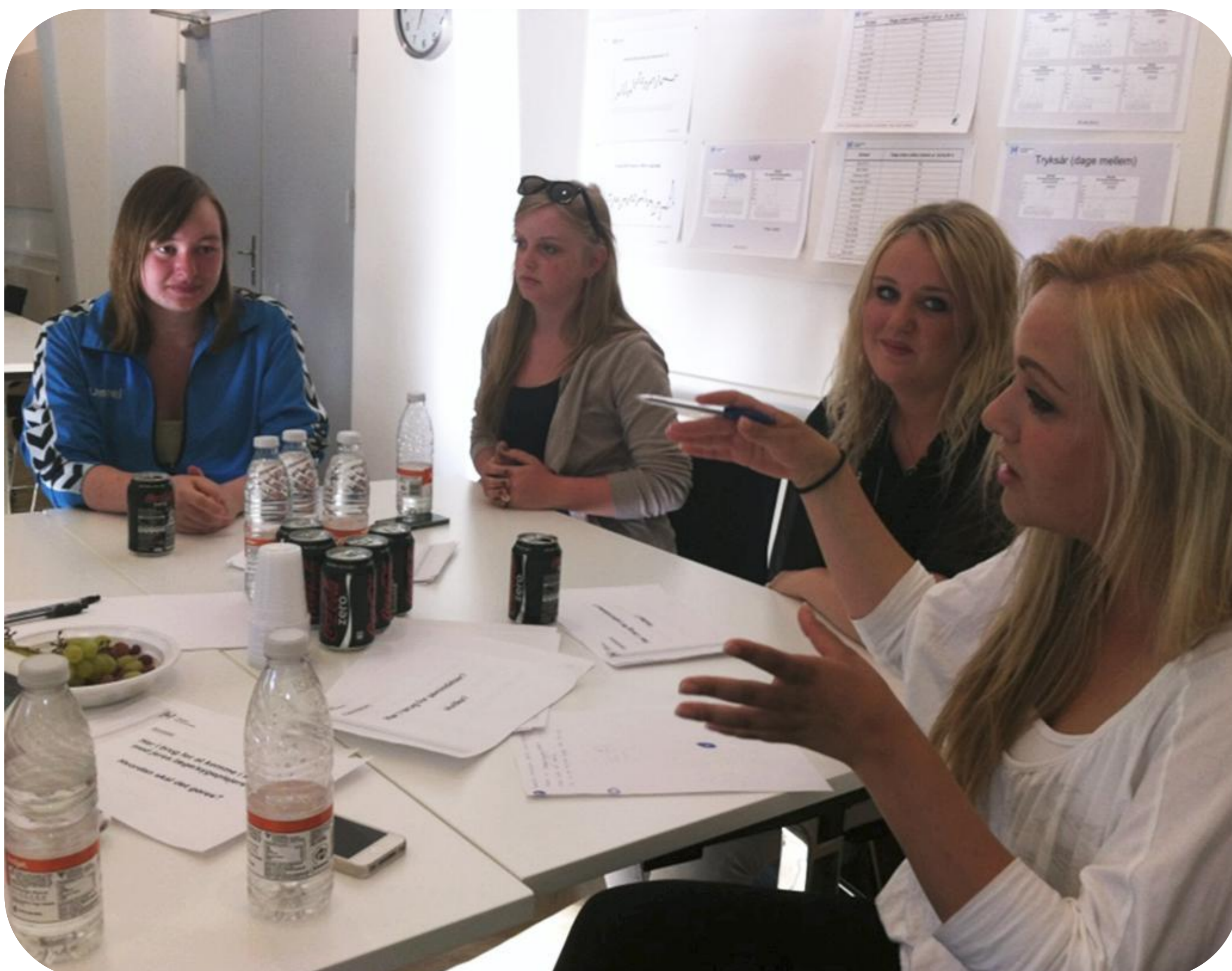
Workshop: Young people shared their wishes and ideas for the app