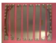
Fig 3. E 2 50µg matrix patch covered with a backing film. The outer edges and six equal pieces have been cut.

In the experiment, two pieces were cut from each patch and stored together with the remaining patch in its foil-lined sachet, either (1) in a plastic bag in a fridge (2) in a plastic bag in room temperature or (3) just in room temperature. Storage duration up to 5 days were compared. E 2 concentrations were determined in pieces with two cut edges, pieces with one cut edge and pieces that had no cut edge during storage (Fig 1).