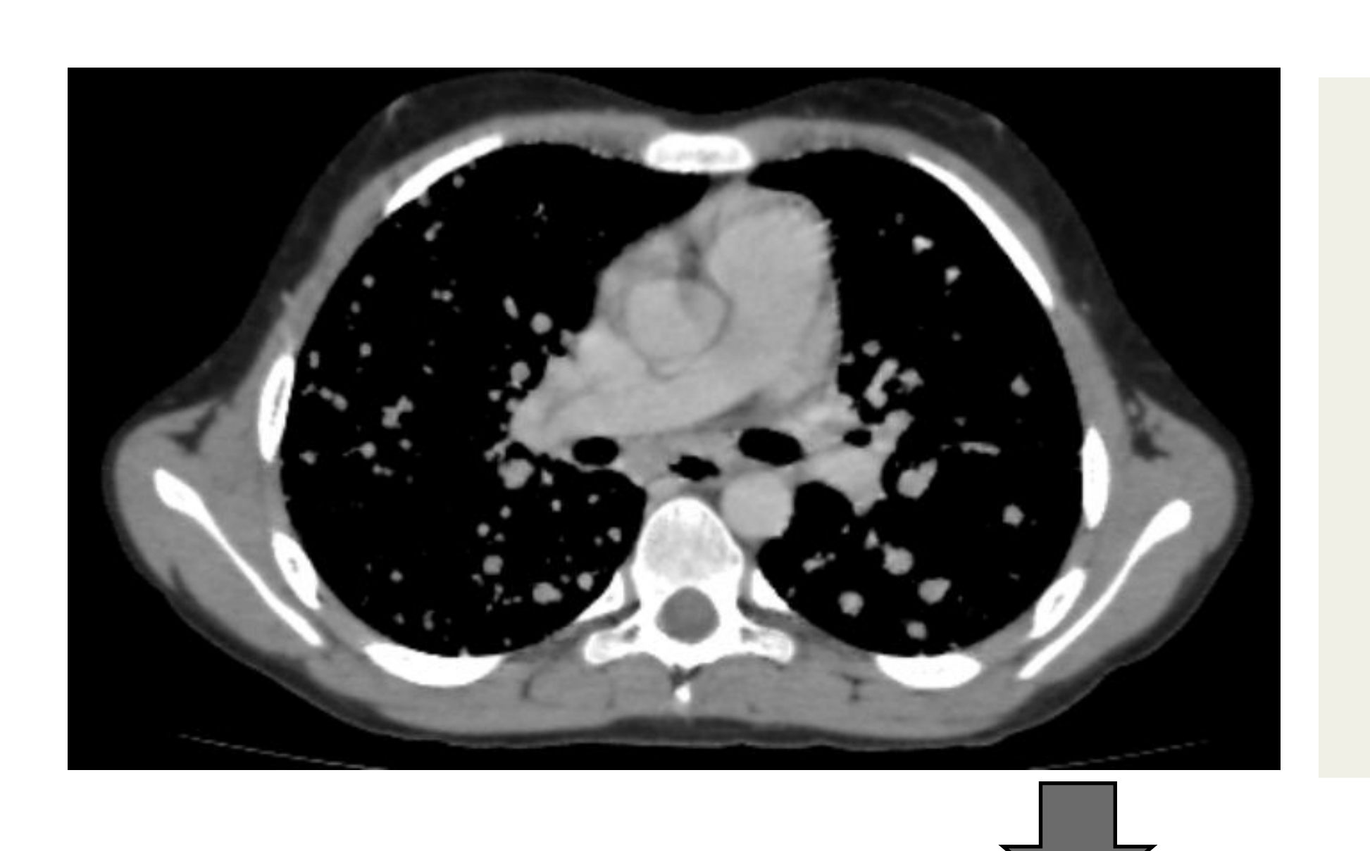
Figure 1. Thorax CT Diffuse infiltration of lungs with multinodular parenchymal infiltrations, mediastinal lymph nodes.