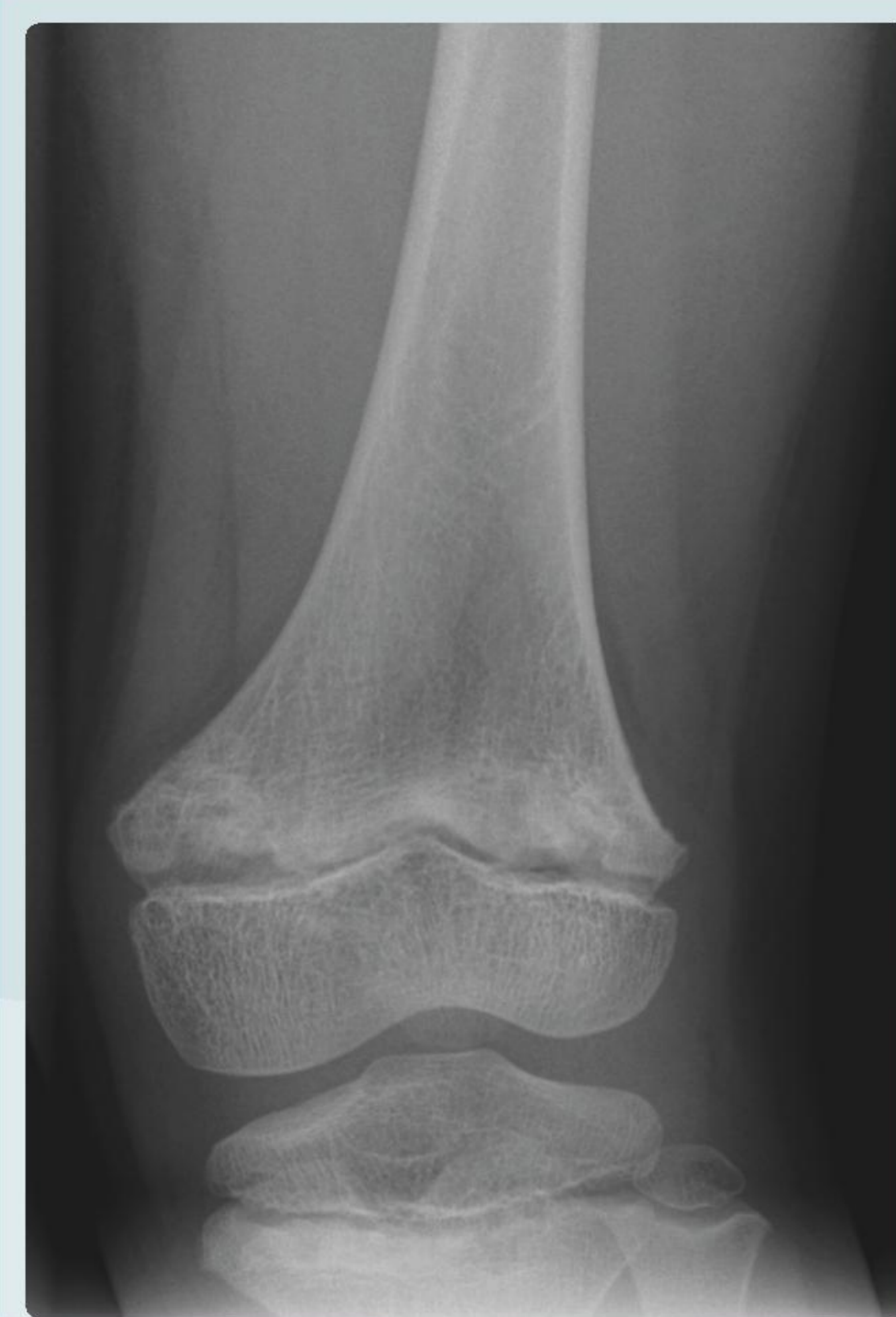
Left distal femur and proximal tibia. Sclerotic and irregular metaphysis.