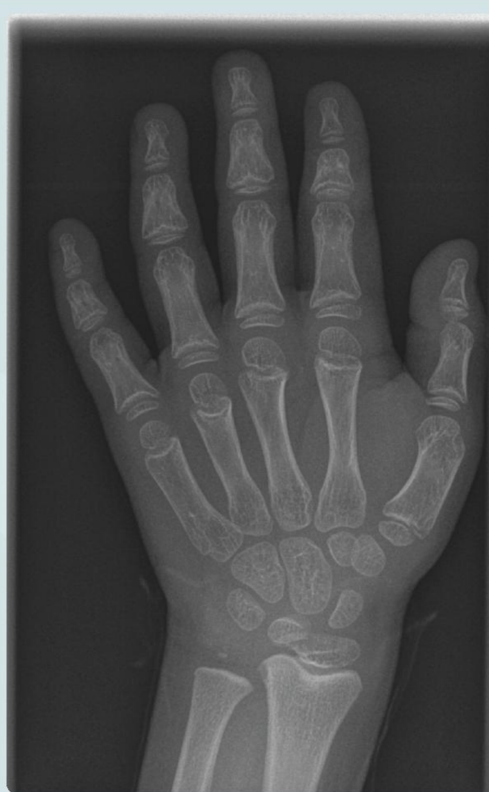
Bone age 6.7 years (manual evaluation) at chronological age 5.9 years. Coarse trabecular structure and short broad middle phalanges. Slightly sclerotic and irregular distal radial metaphysis.