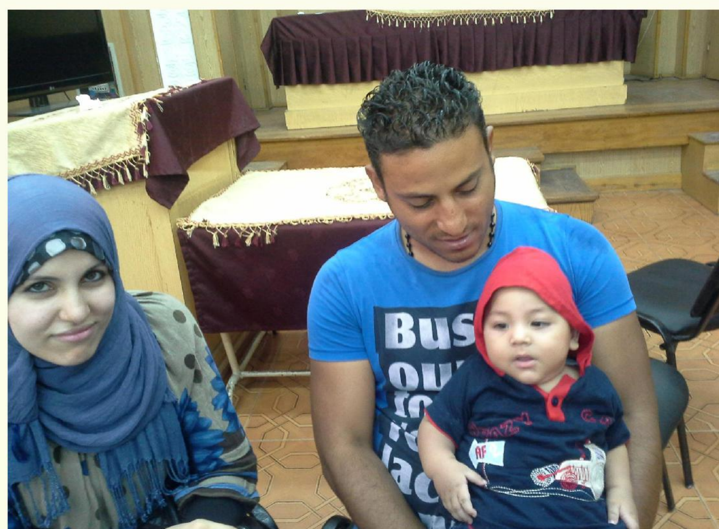
Figure( 2): Photo of the indexed patient and both parents