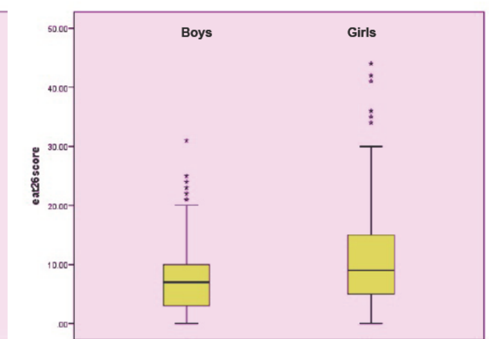
Figure 1: Boxplot of EAT-26 scores of total population. Figure 2: Boxplot of EAT-26 scores according to gender

In the total sample, 39 adolescents (30 girls/ 9 boys) were detected to present serious indications of an eating disorder (9.77%). Signs of serious eating disorder were significantly more prevalent in girls than in boys ( p=0.013 ).