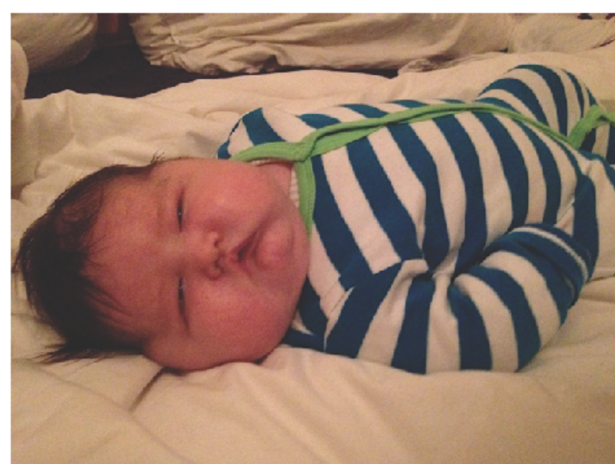
patient at age of 3 months