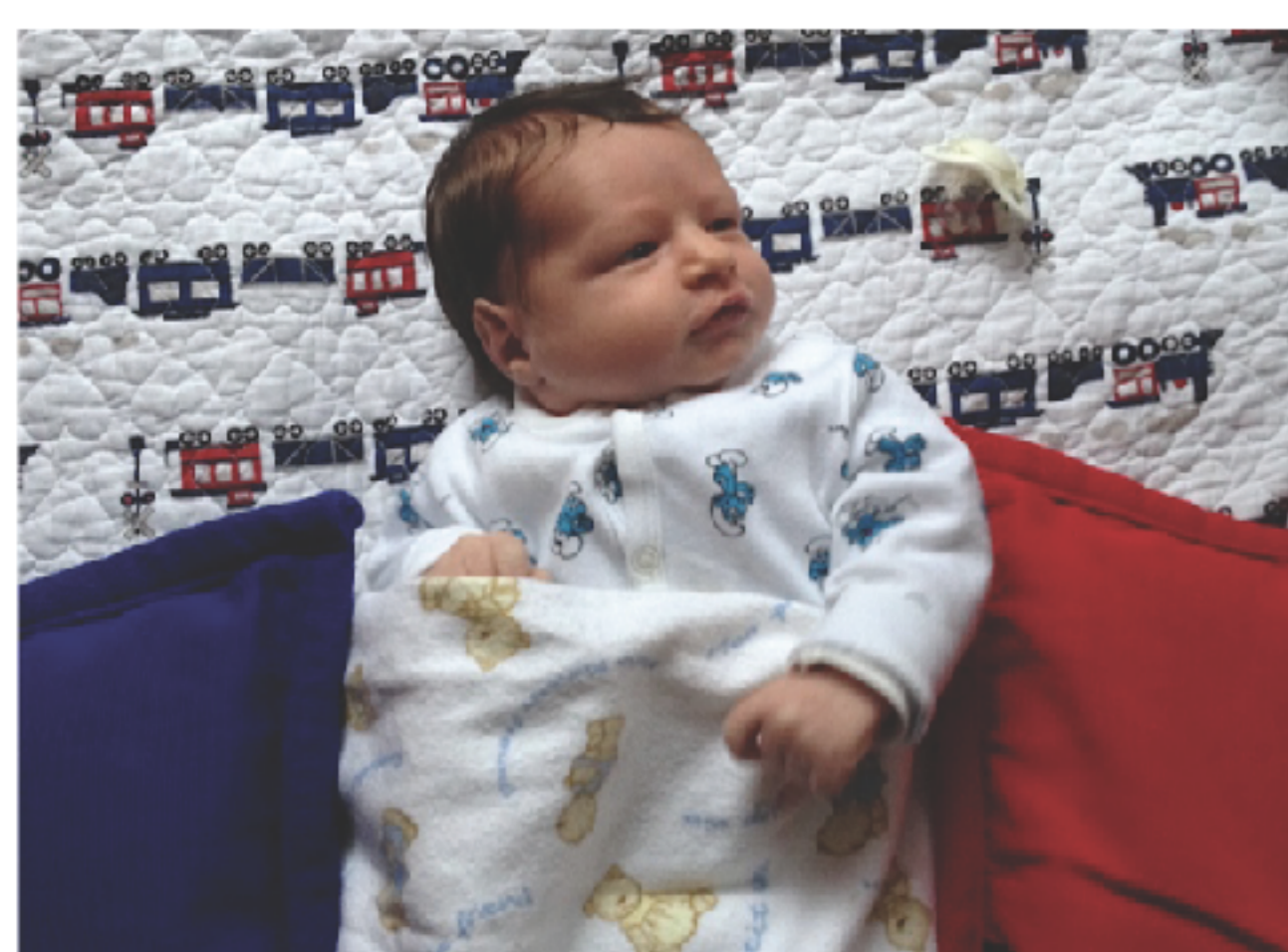
patient at age of 1 month