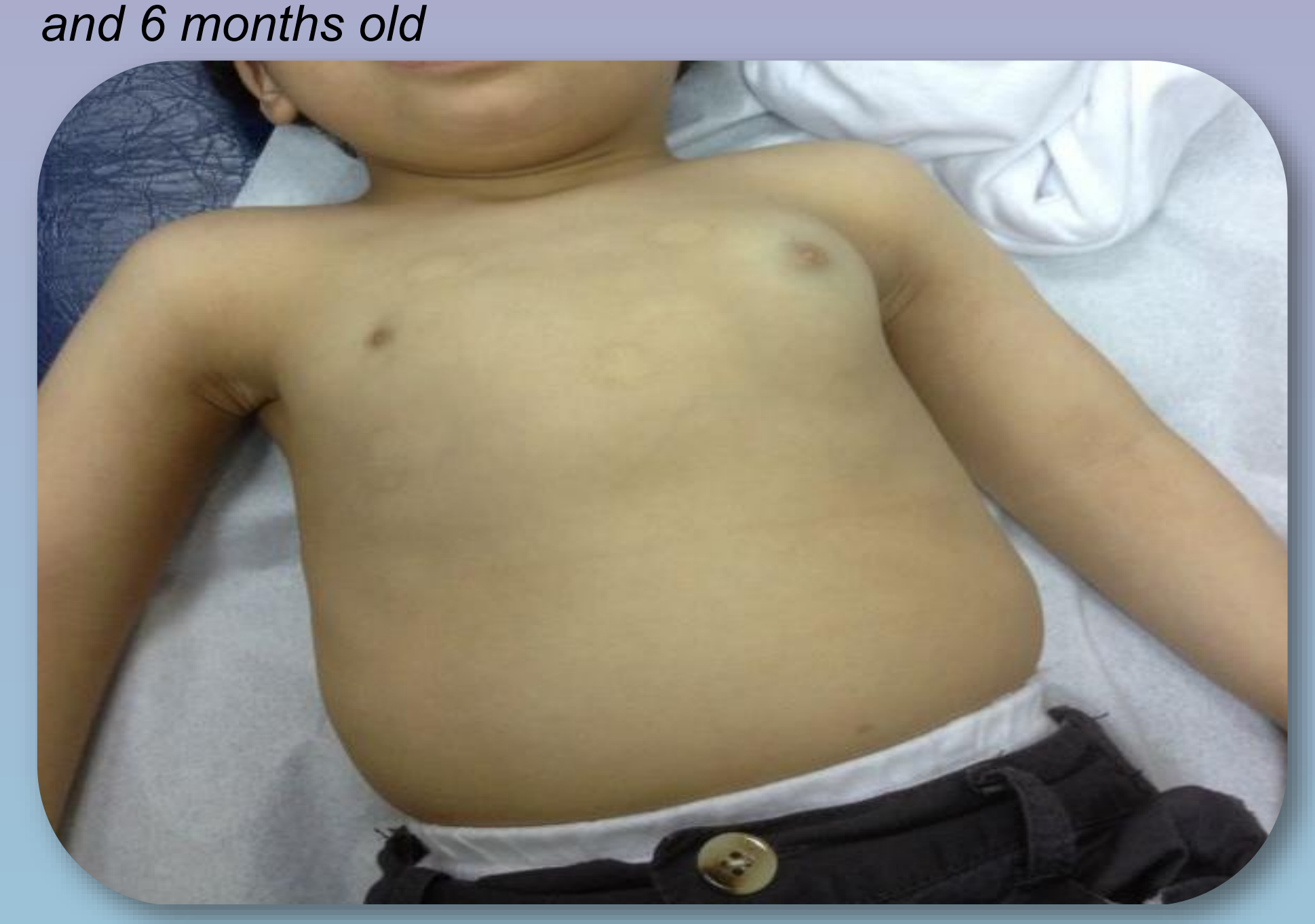
Figure 1. Bilateral Breast Mass of a 2-yearold male occurred when he was still 1year

Galactoceles, which present as cysts or pseudotumors, generally occur in young women after lactation and contain milk or viscous material produced from transformed milk. They have been reported in children as a rare cause of increased breast size and, surprisingly, in males [4, 5]. The etiology of galactoceles remains unknown.