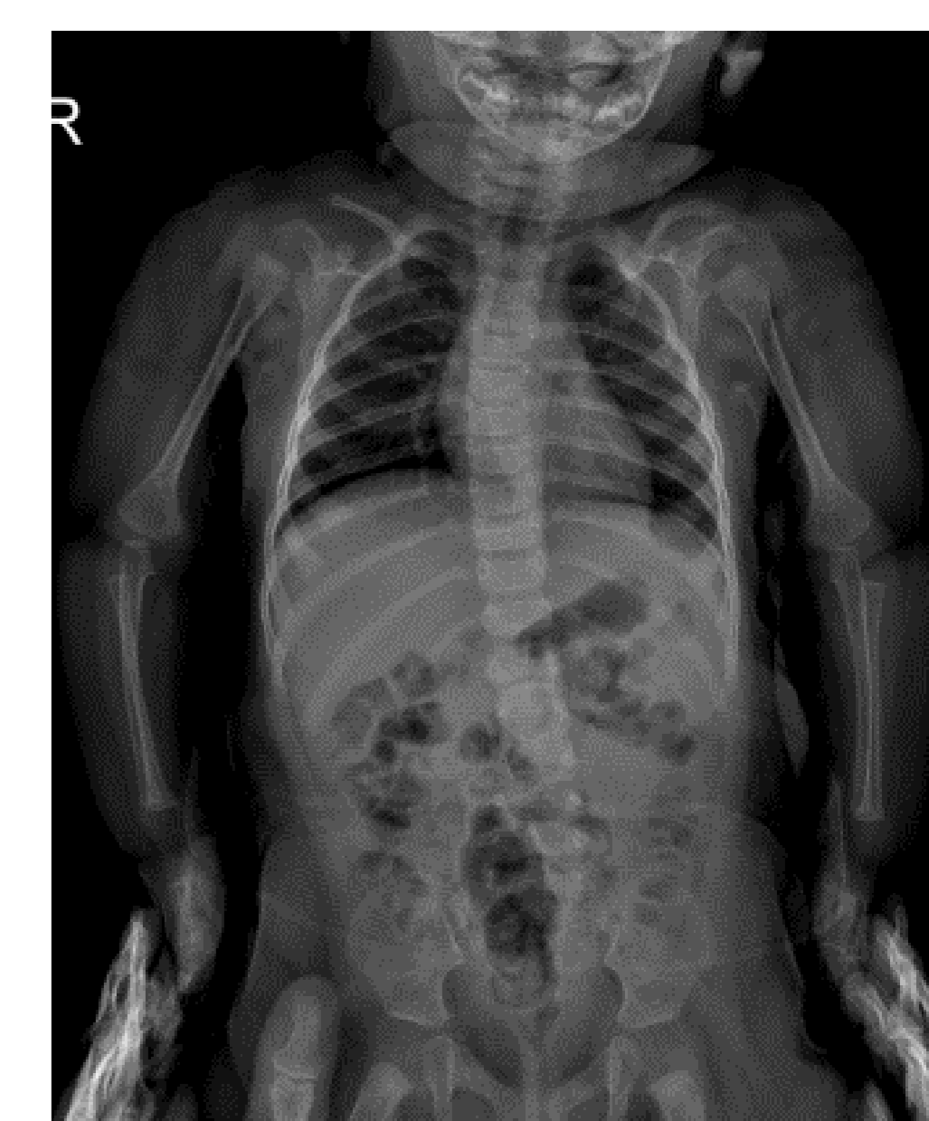
Figure 2. AP graphy of the girl