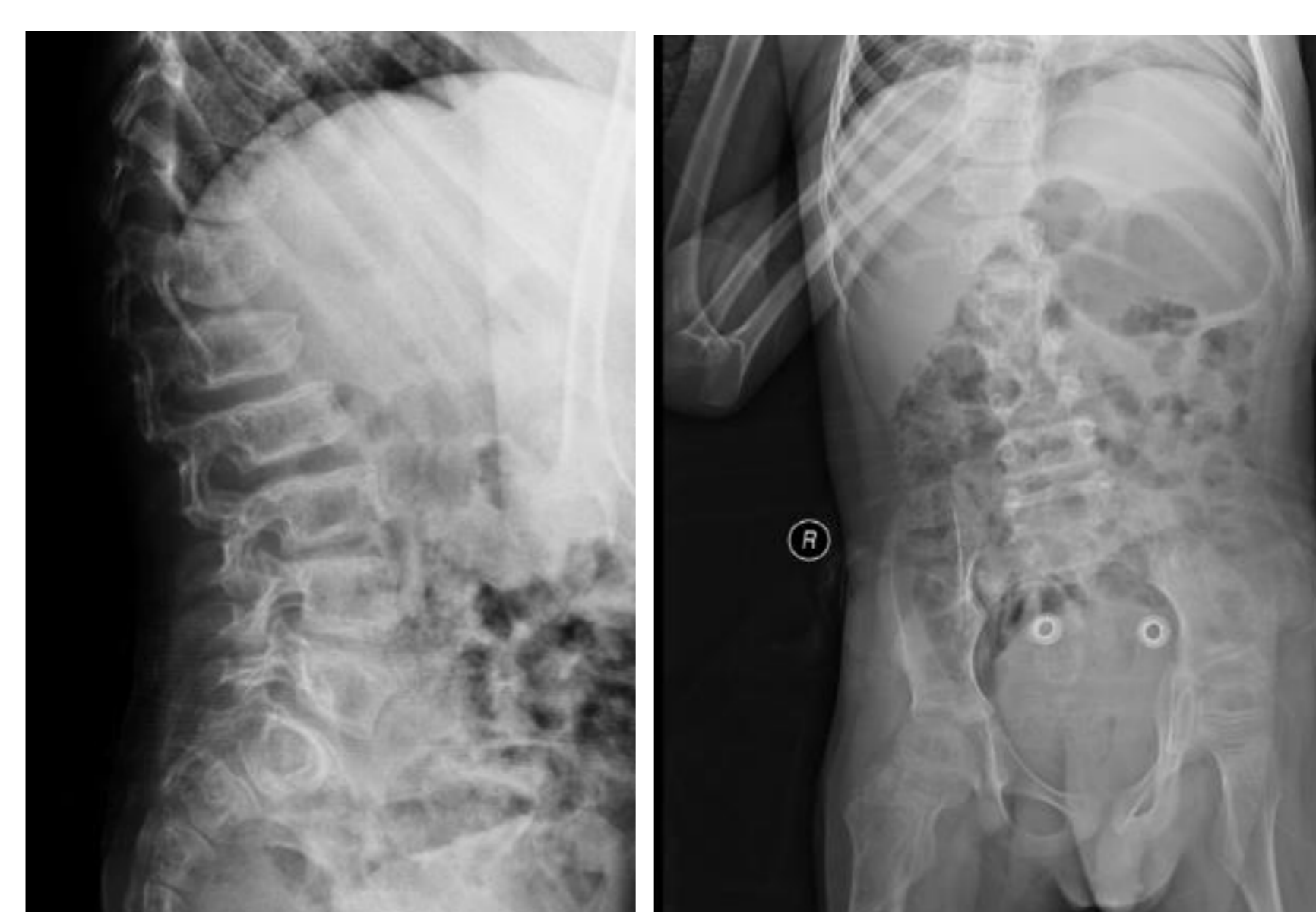
Figure 1. Lateral vertebrae and AP graphy of the boy