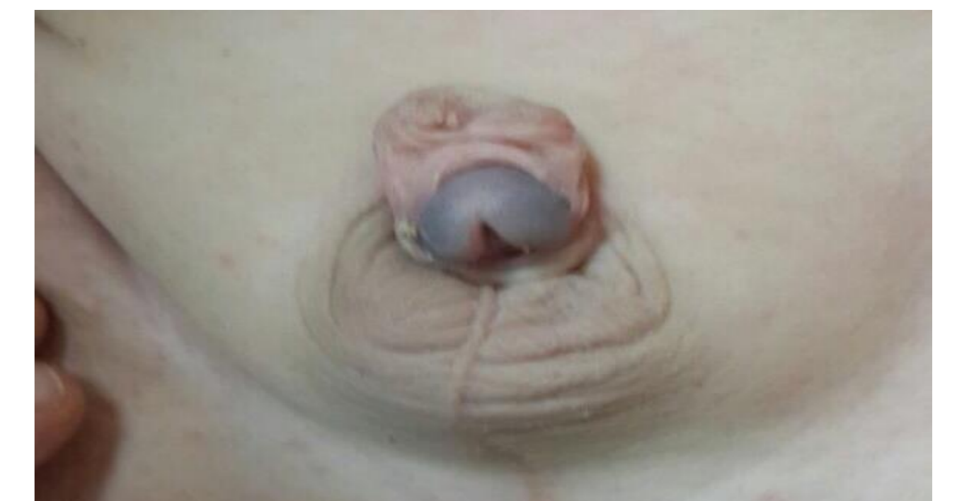
Figure 2. Penoscrotal hypospadias and ventral chordee