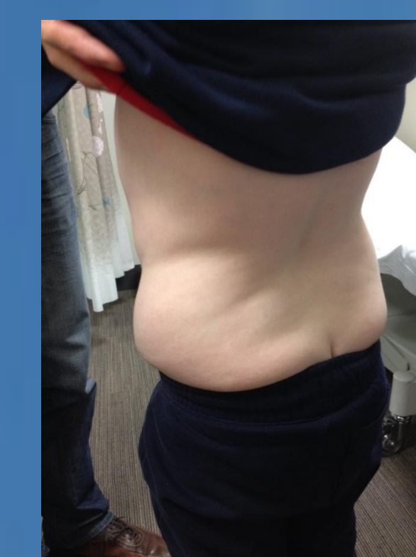
IUGR aged 10