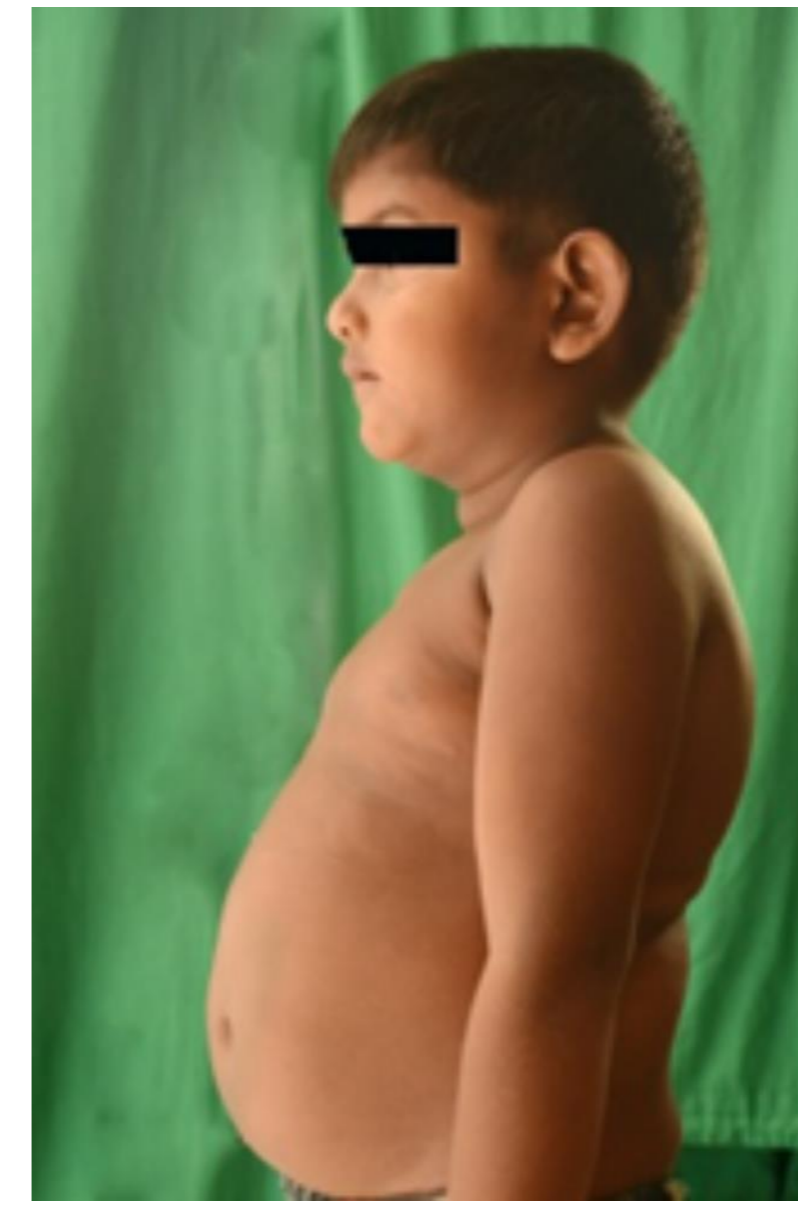
Figure 2 a