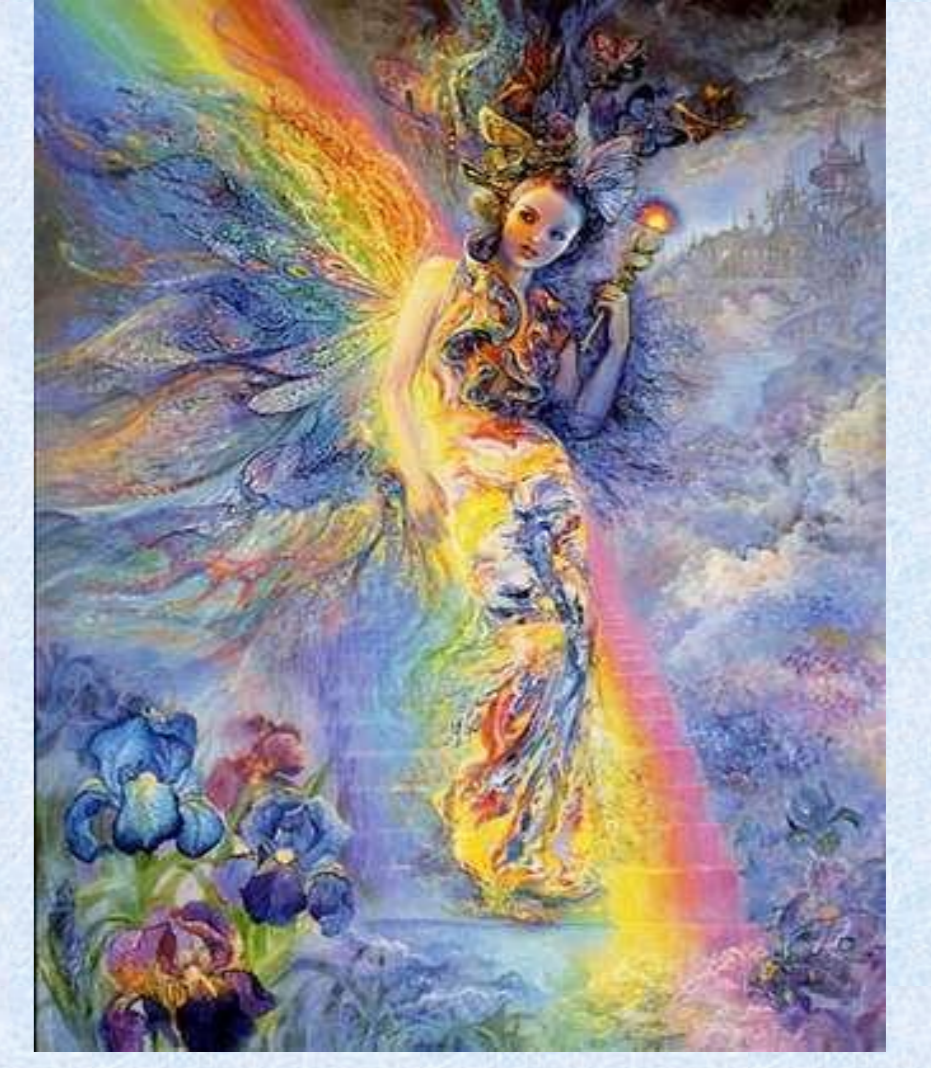
Hormone IRISIN was named after the Greek goddess and messenger Iris

The study was carried out on patients who were admitted to the Kocaeli University Pediatric Endocrinology and Diabetes outpatient clinic between January and July 2014. 125 type 1 diabetic patients (66 boys and 59 girls, mean age: 14.74 \pm 2.26 years), an obese control group (22 boy, 35 girl with mean age 14.11 \pm 2.23 years) and a normal control group (13 boy, 31 girl with mean age 13.09 \pm 2.13 years) were enrolled to the study. The patients were selected among those who aged between 10 and 18 years. The study included patients who were followed-up by the Pediatric Endocrinology outpatient clinic of our hospital with the diagnosis of hyperglycemia and classified as type 1 according to ISPAD 2011. The metabolic parameters, anthropometric characteristics and body fat distributions and z-scores (by DXA) were measured and relationships of these with the serum irisin levels were examined.