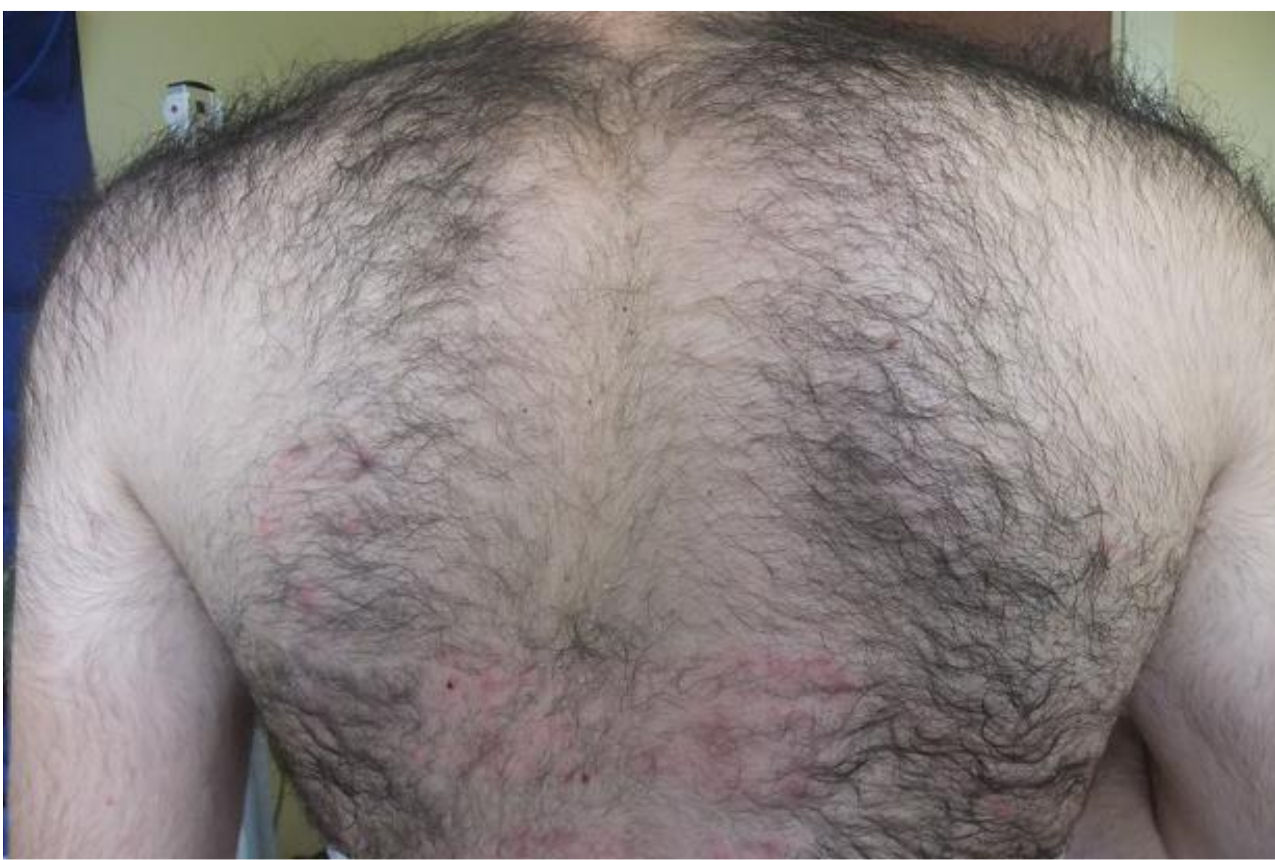
Figure 1: Severe hirsutism on the shoulders and back region of the patient at 10 years old.

PURPOSE: Here we present a patient with \beta -hCG-ST of which the localization was found after 6 years follow up and several operations. We aim to emphasize the diagnostic difficulties of \beta -hCG-ST.