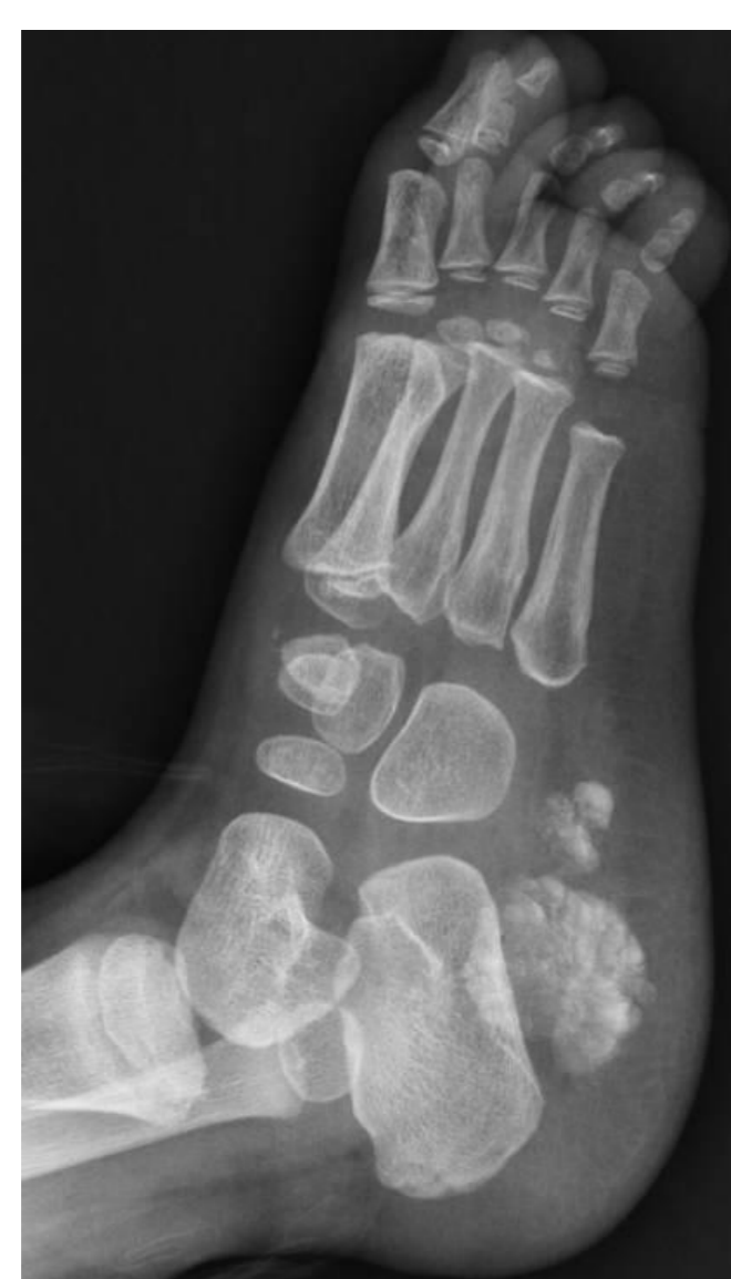
Right Foot X-ray