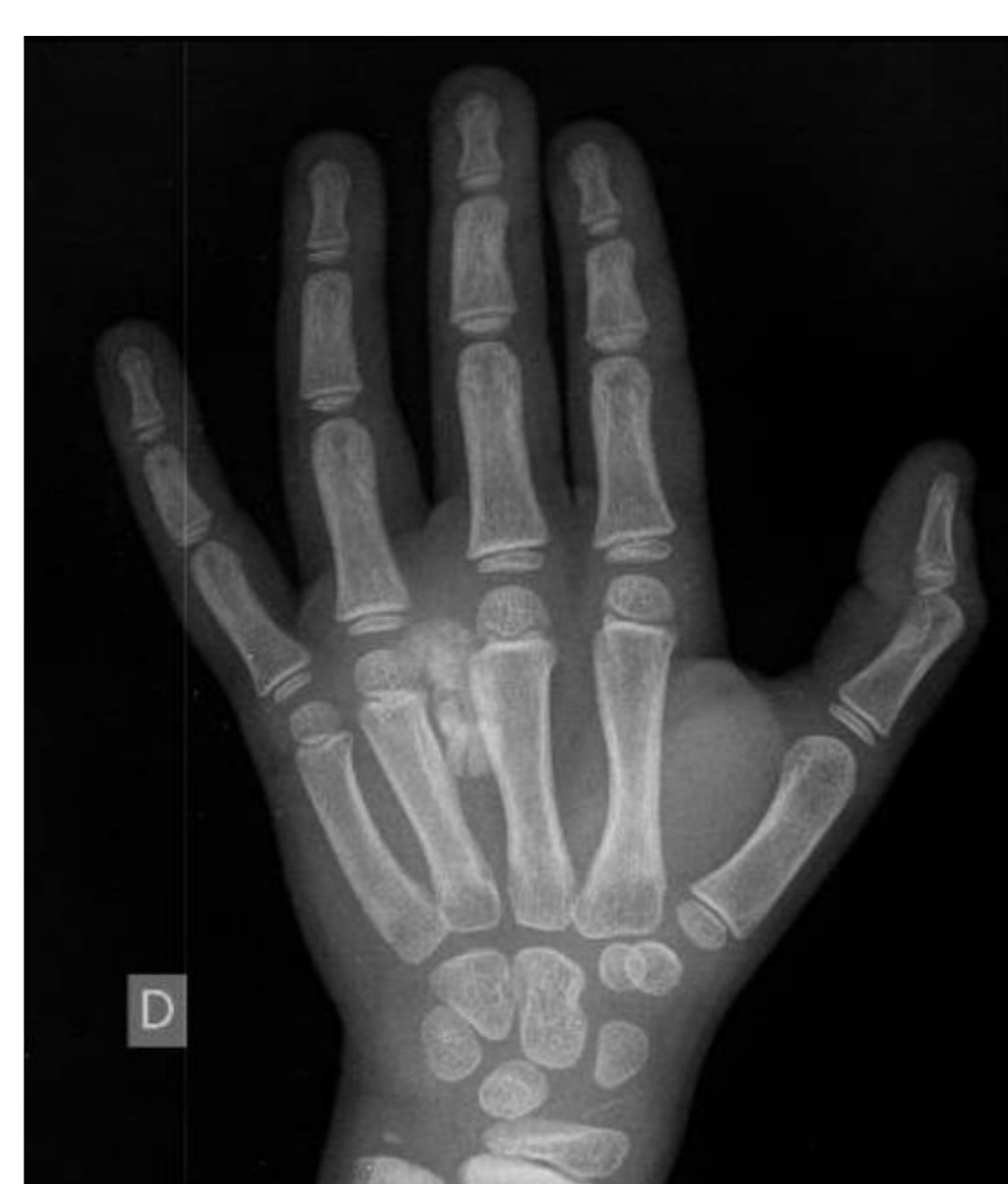
Right Hand X-ray