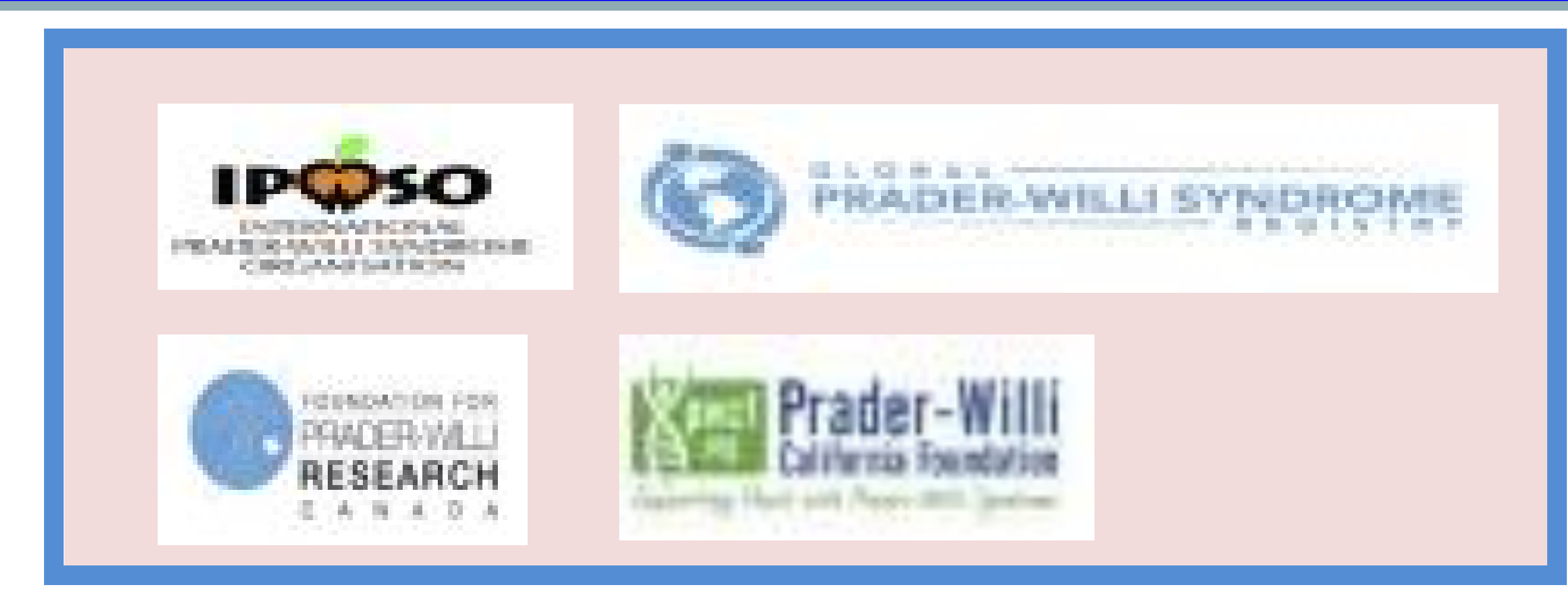
Figure 1. There are many different organisations for children with PWS.

The main reason of decrement of growth in children with Prader-Willi Syndrome (PWS) is dysfunction of hypothalamo-hypophseal axis (HHA) and a decrease in the capacity of secretion of growth hormone (GH). In fact, in some cases, GH levels are normal, so there may be other factors in the etiology.