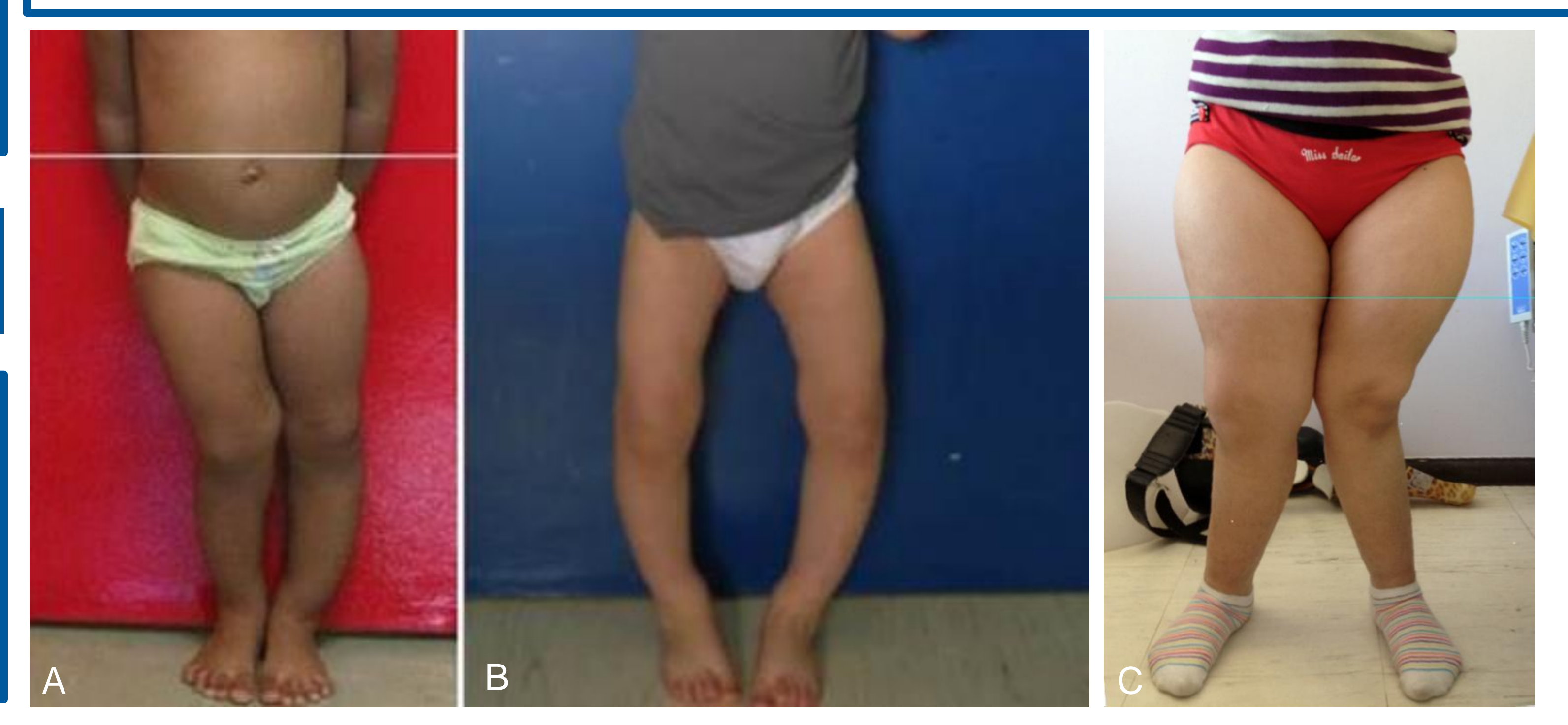
Figure 1: Leg deformities in XLHR A . Right leg in valgum, left leg in varum. B . genu valgum. C . Genu valgum

Prior to surgery, 42/49 received alfalcalcidol and phosphate 29/49 had a value of Alk. Phos. within the normal range.