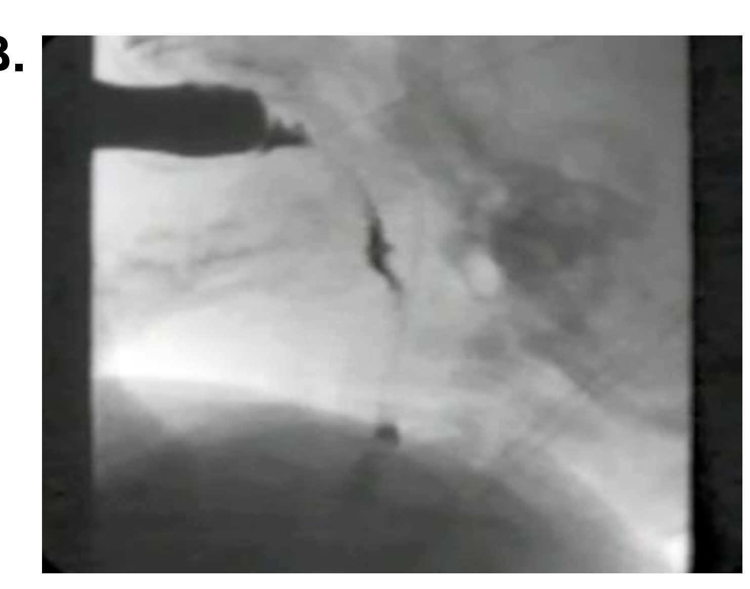
Figure 1. Images from a VFSS (A) Aspiration during swallow, (B) Pharyngeal residue present after swallow.