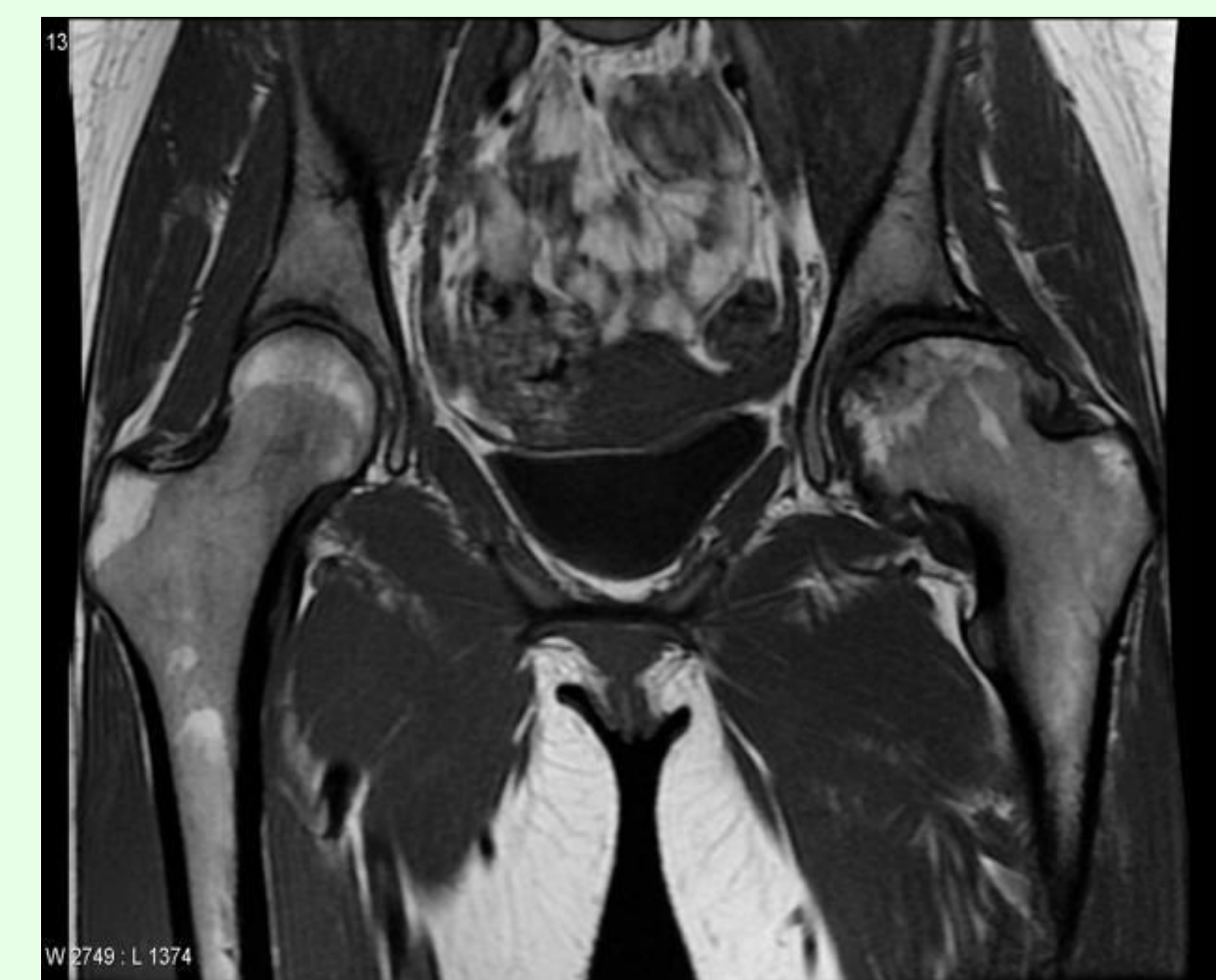
Osteonecrosis of left hip

http://childhealth.leeds.ac.uk/bones.html