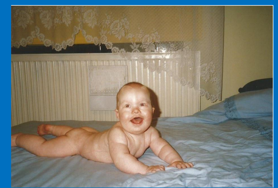
Male neonate with Simpson-Golabi-Behmel syndrome