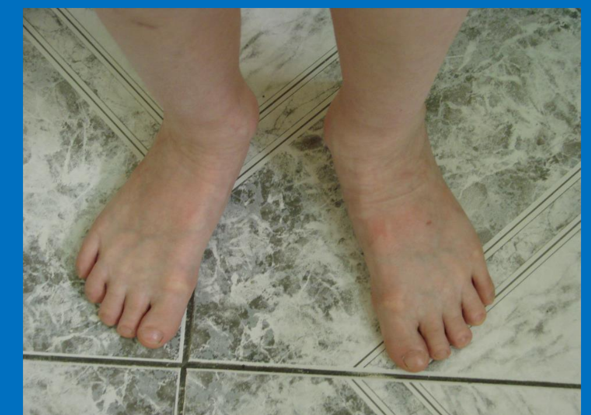
Boy at 6 years old