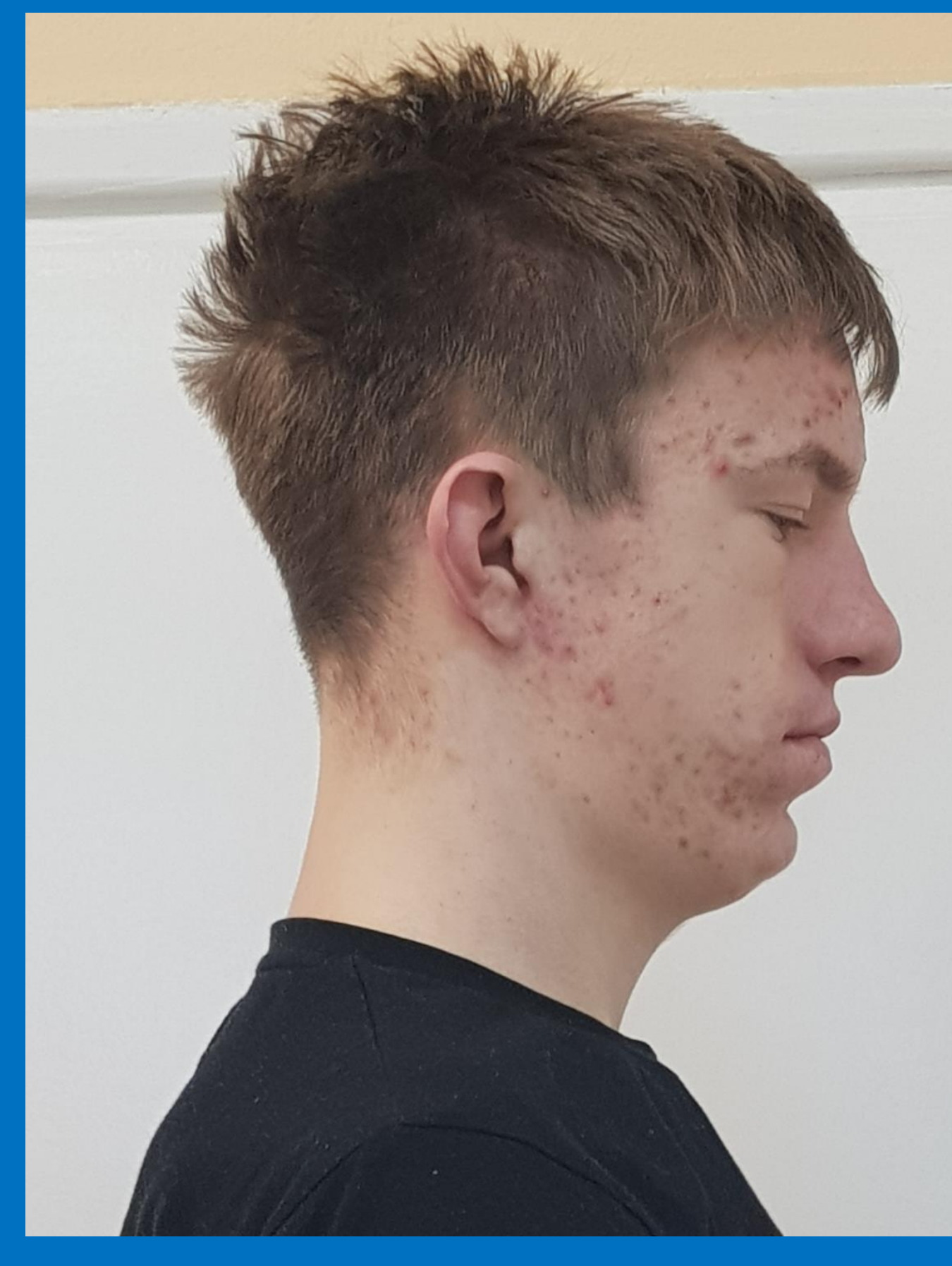
Boy at 14 years old