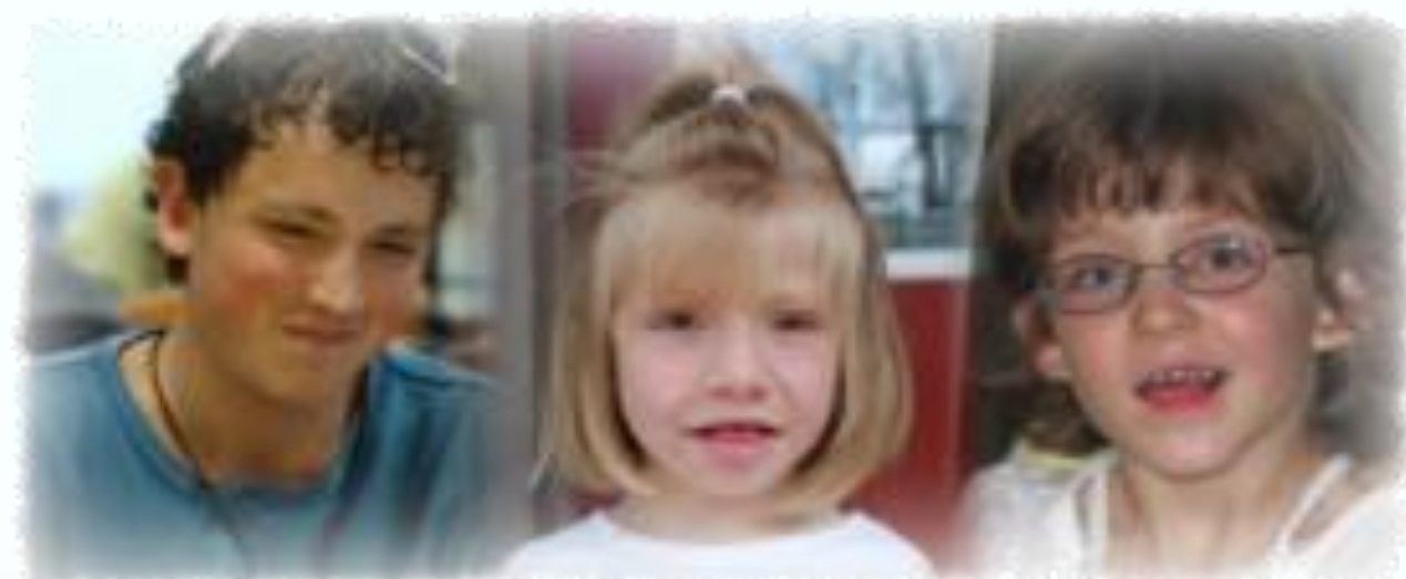
Kabuki Syndrome Network

Kabuki syndrome (KS) is a rare genetic disorder (1 in 32,000 newborns) caused by mutations in the KMT2D gene (autosomal dominant pattern) or the KDM6A gene (X-linked dominant inheritance). KS is characterized by distinctive facial features including arched eyebrows, long eyelashes, long palpebral fissures with everted lower lids at the outside edges, flat, broadened tip of the nose and large protruding earlobes. The name of this disorder comes from the resemblance of its characteristic facial appearance to stage makeup used in traditional Japanese Kabuki theater. KS patients show also mild to severe developmental delay and intellectual disability. Other characteristic features of KS include seizures, microcephaly short stature, early puberty, skeletal abnormalities such as scoliosis and cleft palate, heart abnormalities, hearing loss and strabismus.