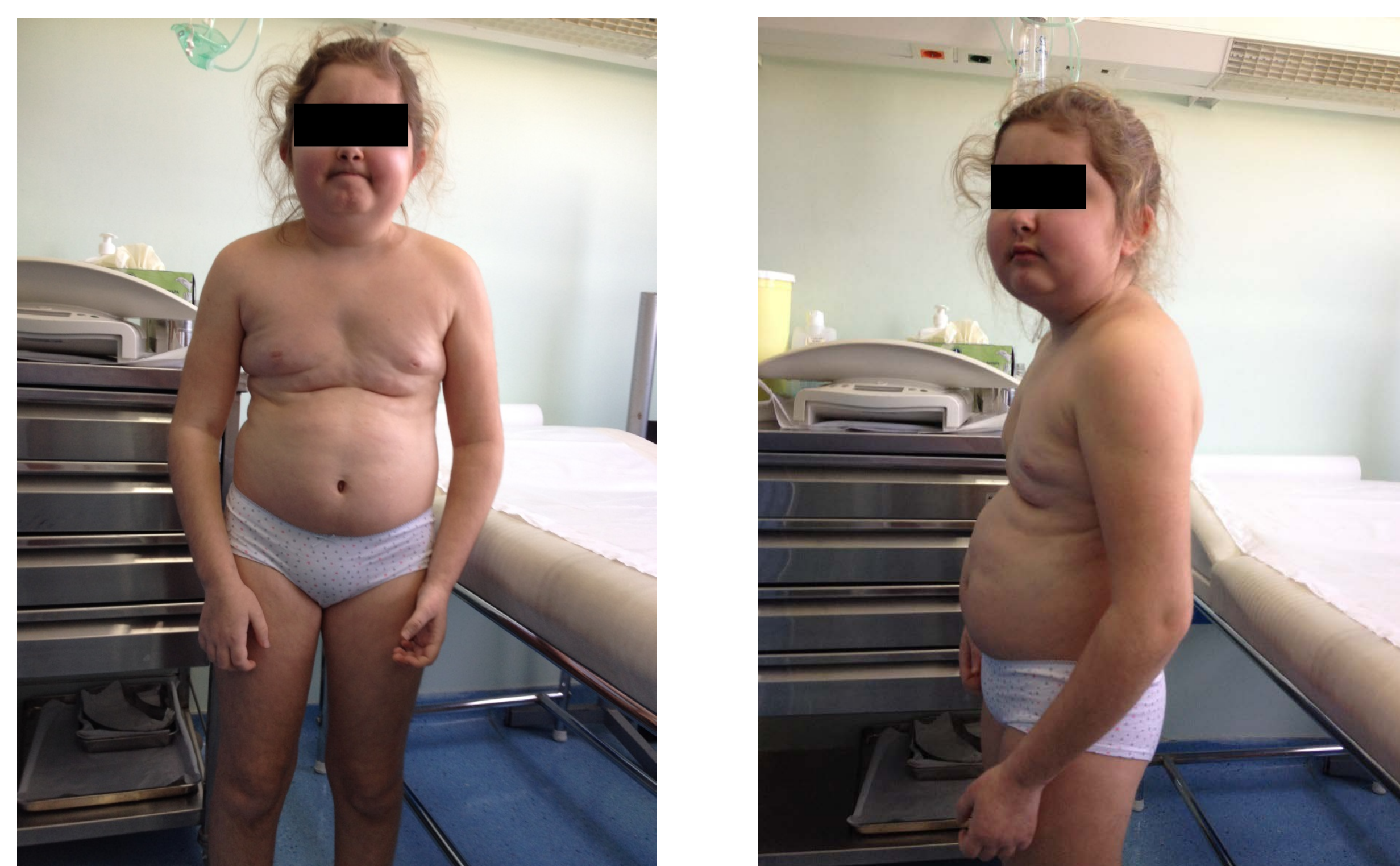
Figure 1: The patient at her first presentation

A 12-year old girl (Figure 1) was referred on account of rapid weight gain, fatigue, growth deceleration and facial hypertrichosis. She had a history of gait instability and ataxia till the age of 5 years and had primary nocturnal enuresis. Her mother had administered a Chinese herb (rehmania root) for 2 months prior to her presentation. Clinical examination revealed buffalo hump, moon facies, central obesity, dysmetria and ataxia. Her height was 128.4 cm (<3 rd centile), her weight was 32.3 kg (3 rd – 10 th centile) (Figure 2) and her BMI was 19.6 kg/m 2 (25 th - 50 th centile). Her Tanner pubertal stages were B1, P3, AH1.