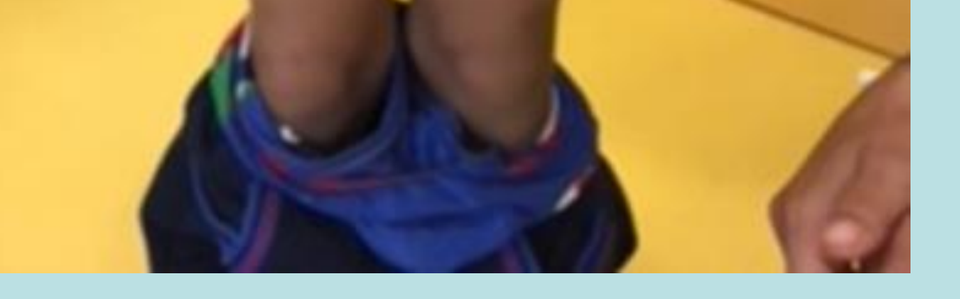
Figure 1:Genital aspect

Genital examination found a G3P2 Tanner stage with right testis volume of 6cc and left of 3cc.