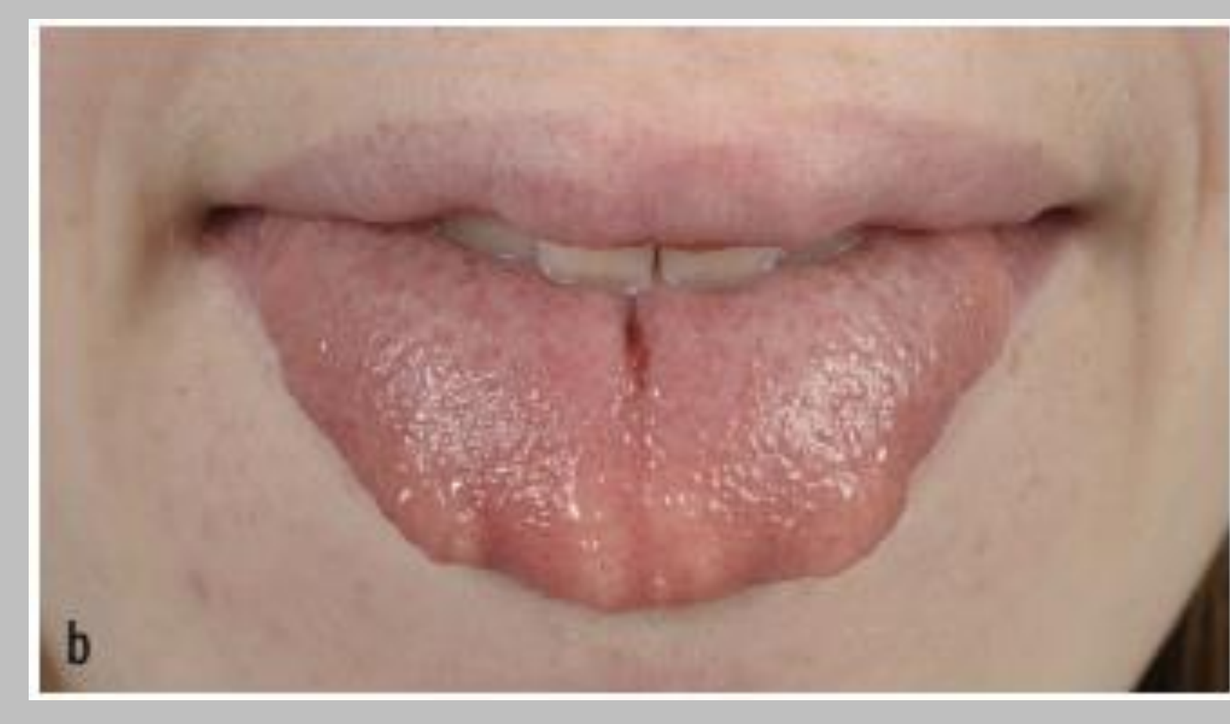
Figure 1. Phenotypical characteristics of MEN-2B. A. Hypertrophic bumpy lips. B. Oral neuromas on the tongue (printed with the patient's permission)<sup>5</sup>".