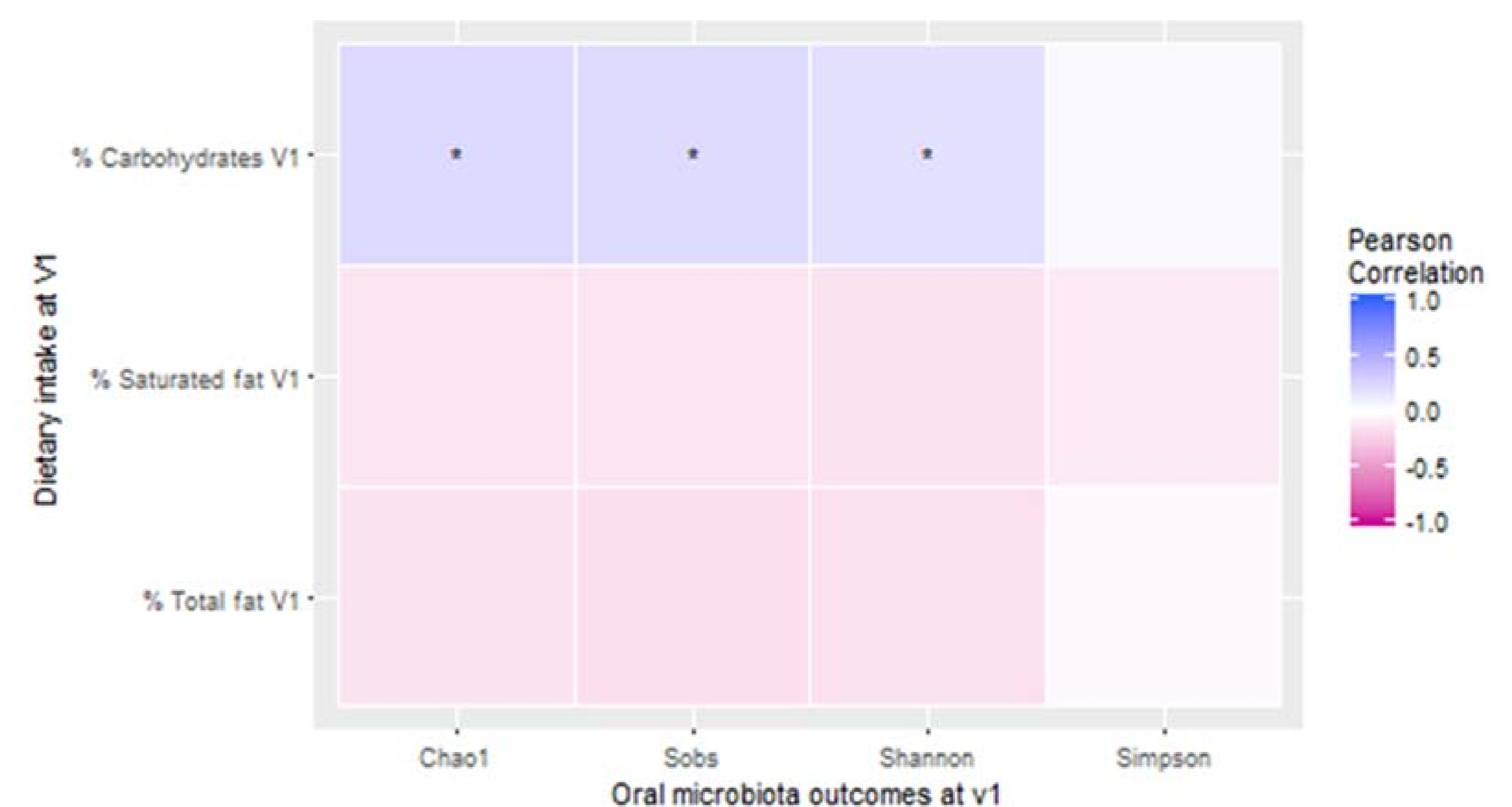
Figure 2: Correlation heat map of oral microbiota alpha-diversity indices at 8-10 yrs and dietary intake at baseline (8-10 yrs)

Physical activity, fitness and screen time were not associated with oral microbiota diversity at 8-10 yr.