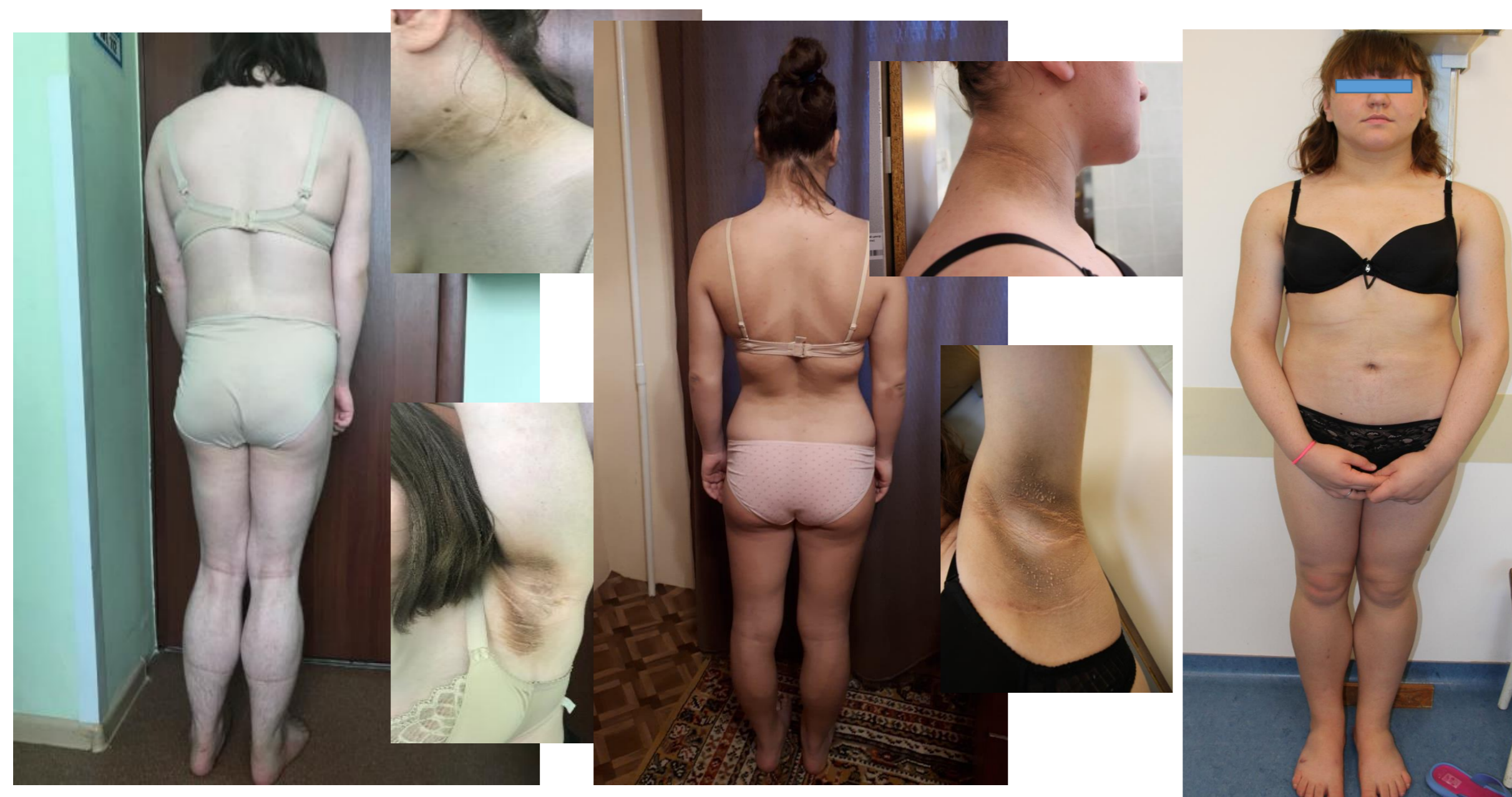
Figure 1. Clinical presentation of the patients with FPLD4.

Phenotype. Two girls (14.1 and 15.3 years) were referred to our clinic with suspicion of acromegaly, one girl (14.2 years) was referred with polydipsia, polyuria. All three patients shared similar clinical (Fig. 1) and metabolic findings: acromegalic features, loss of subcutaneous fat from extremities, excess fat depots of the face and neck, prominent muscular appearance of the calves, acanthosis nigricans, hirsutism, steatohepatitis, mild hypertension; hypertriglyceridemia and insulin resistance. 2 of 3 girls had mild diabetes mellitus. One girl had a history of recurrent pancreatitis and partial resection of the pancreas due to pancreatic necrosis. Her mother showed a similar phenotype. The family histories of the two other patients were unremarkable.