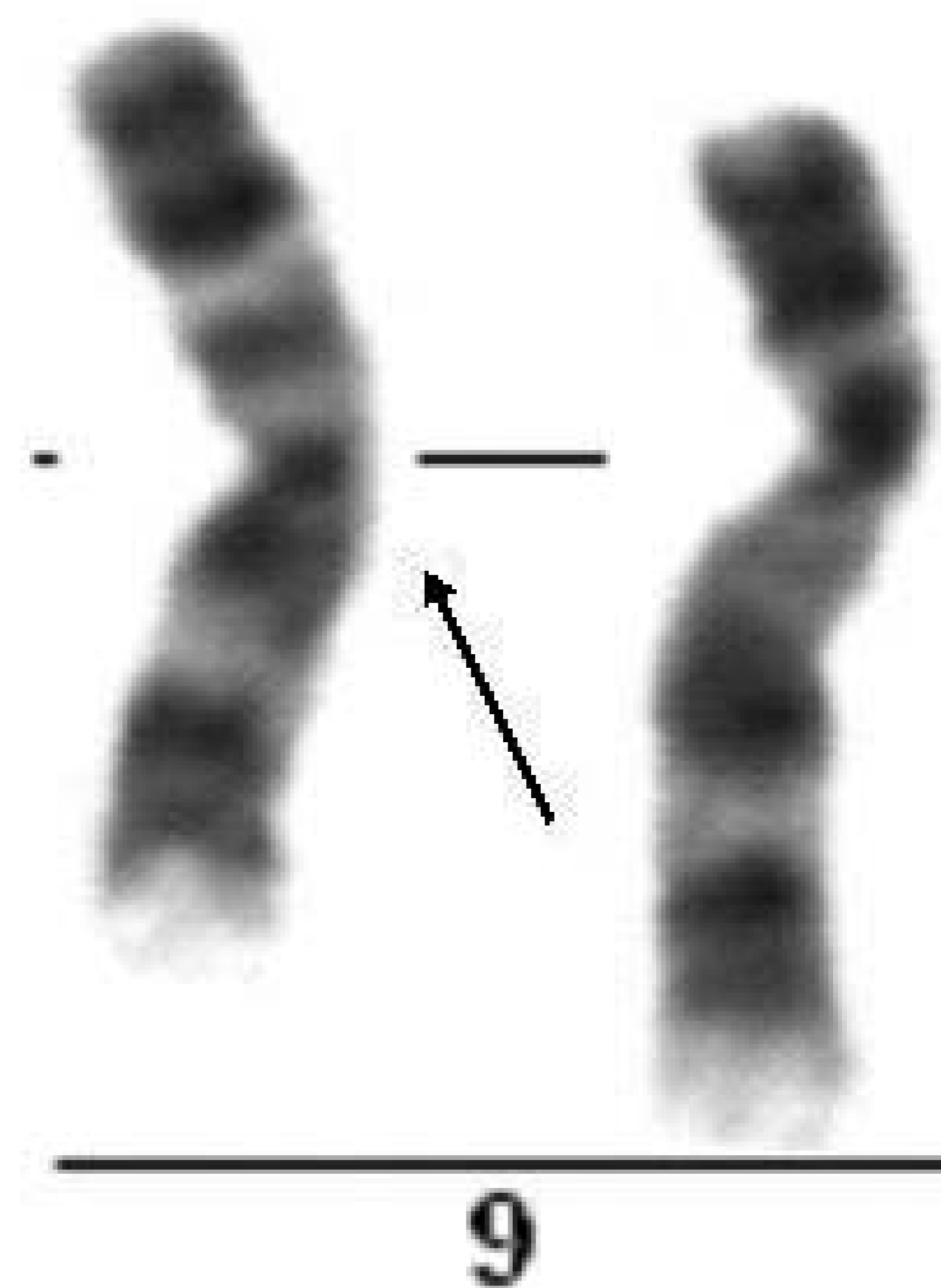
Microphotograph of human chromosome 9 with the most common type of pericentric inversion: inv(9)(p11q13) on the left; G-banding.