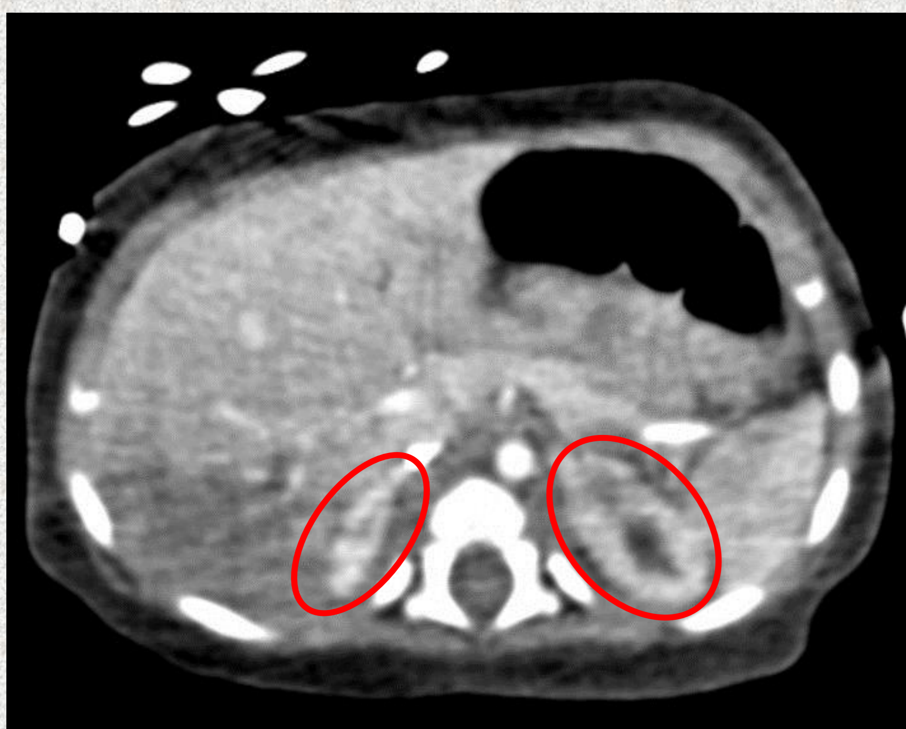
Figure 1: Hyperenhanced adrenal glands with no focal lesion. The adrenal size is normal for 3 months of age.