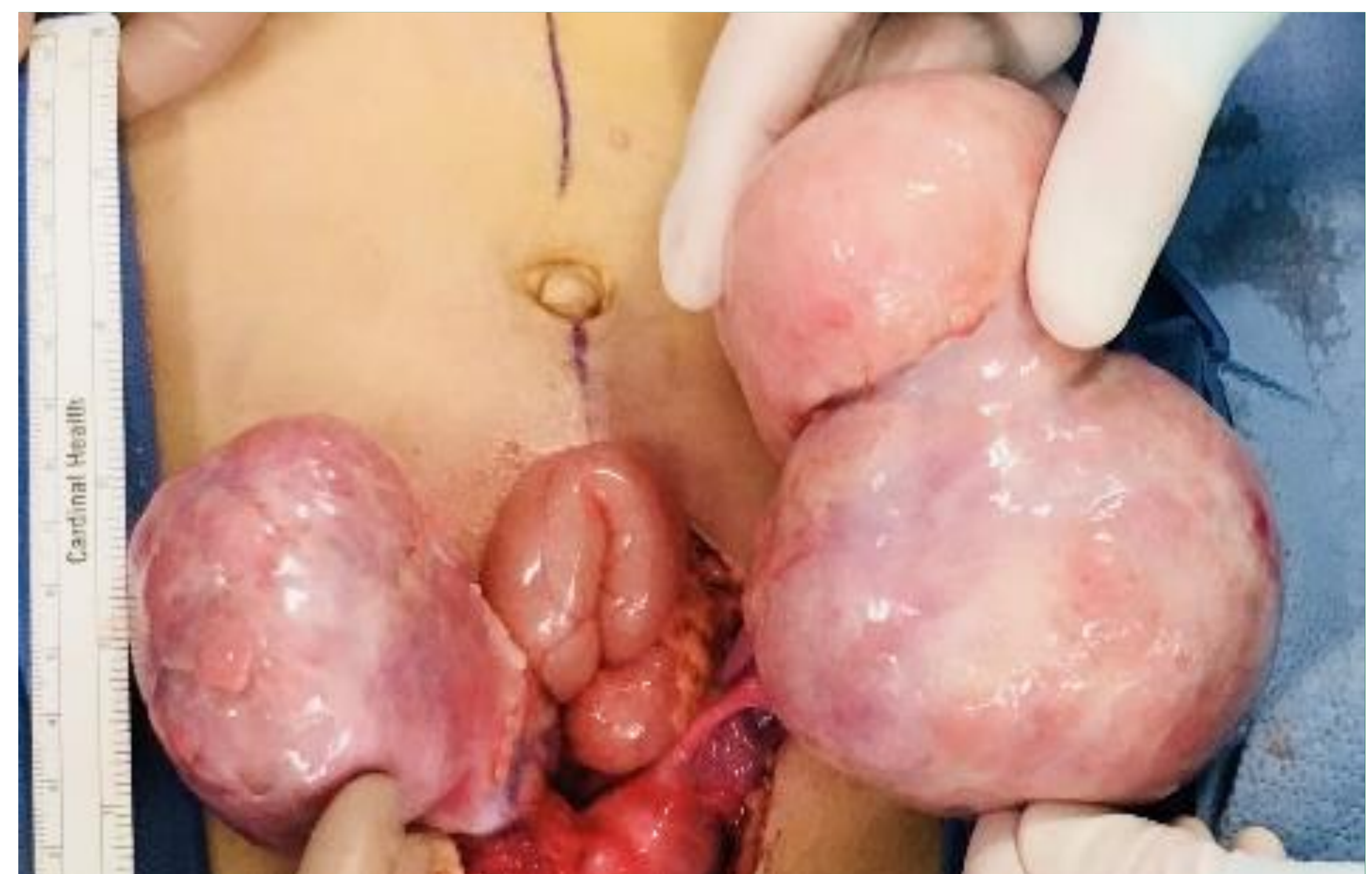
Figure 1. Intraoperative findings of bilateral dysgerminomas