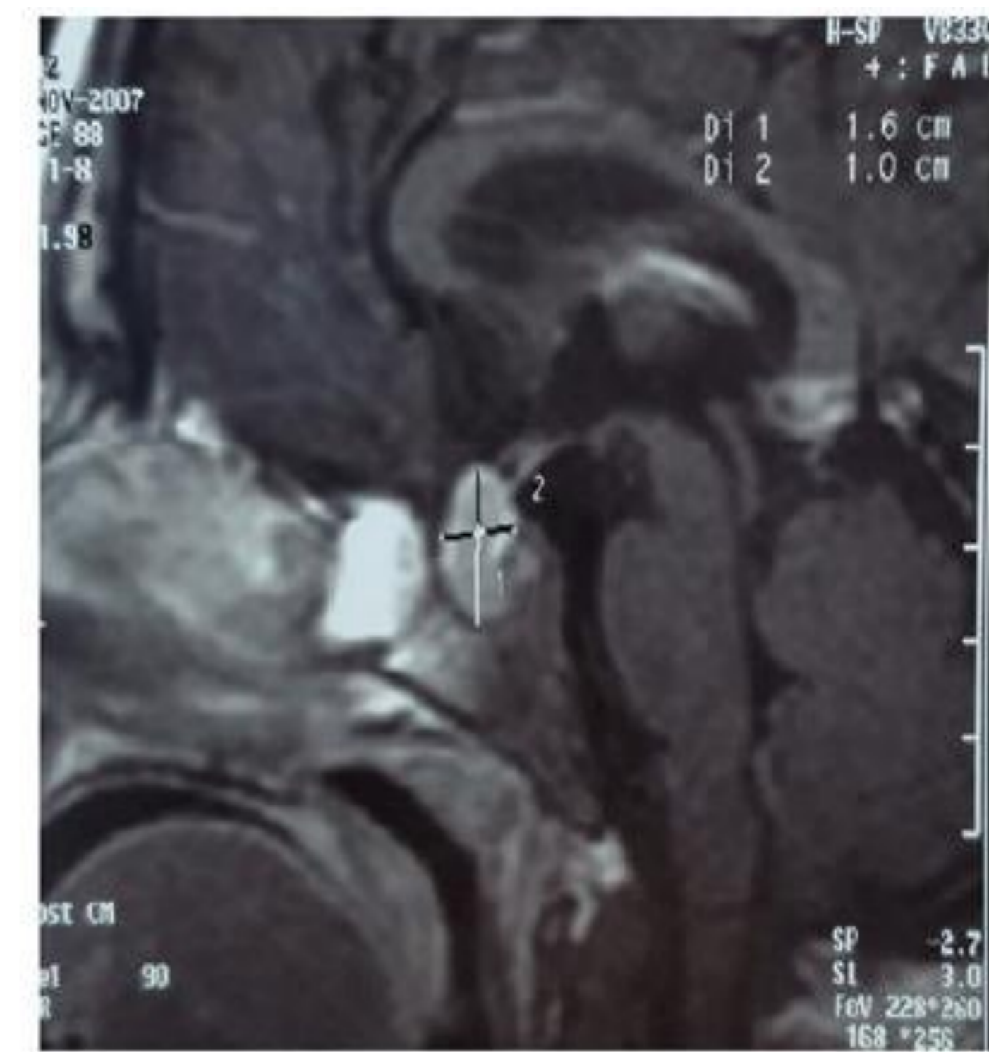
Fig 1: Initial MRI of the pituitary gland. Post enhanced T1 weighted sagittal MRI shows marked enlargement of the pituitary gland that extends slightly into the suprasellar region, with homogeneous enhancement