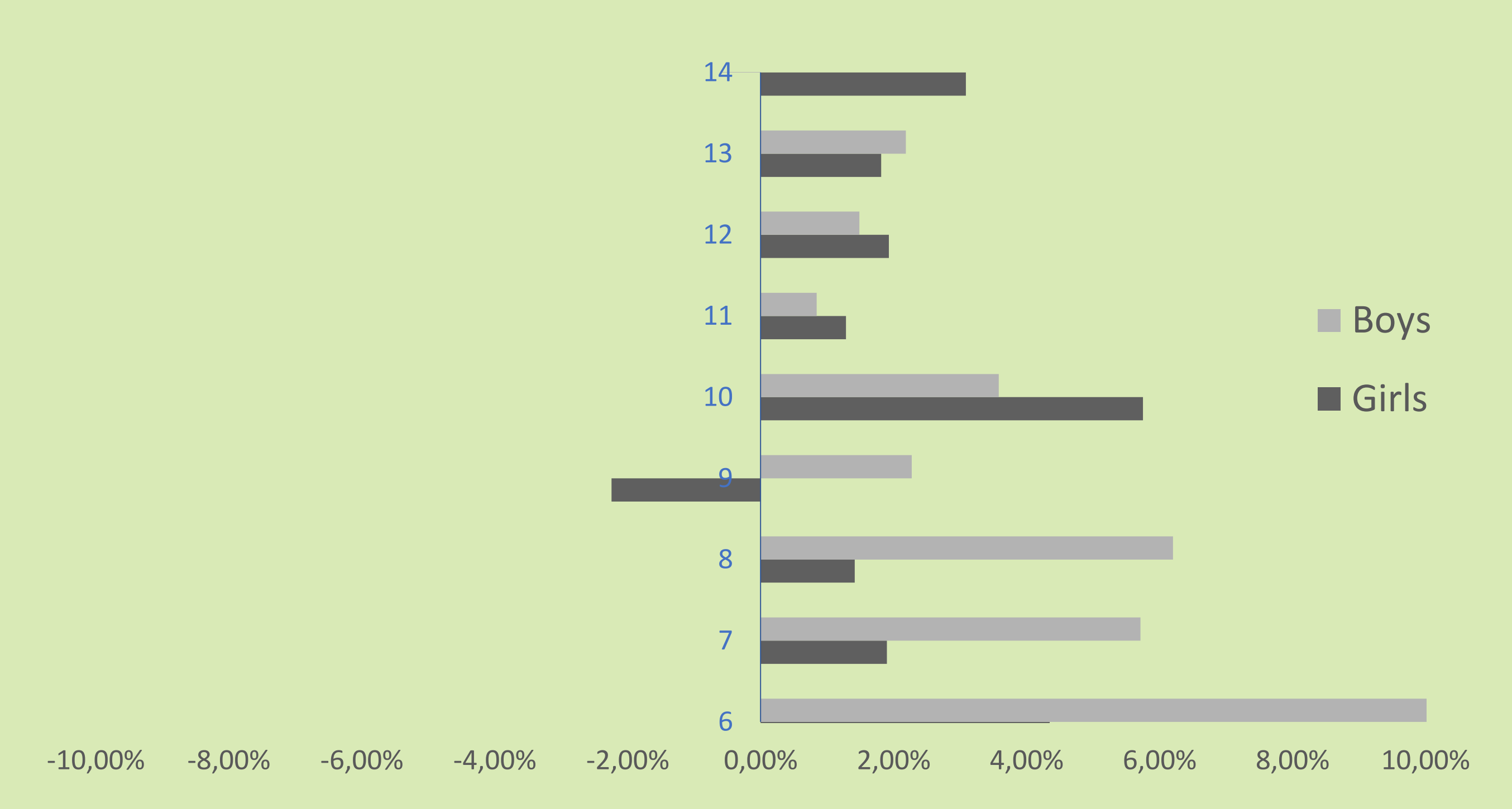
Fig. 3 – Underweight prevalence difference