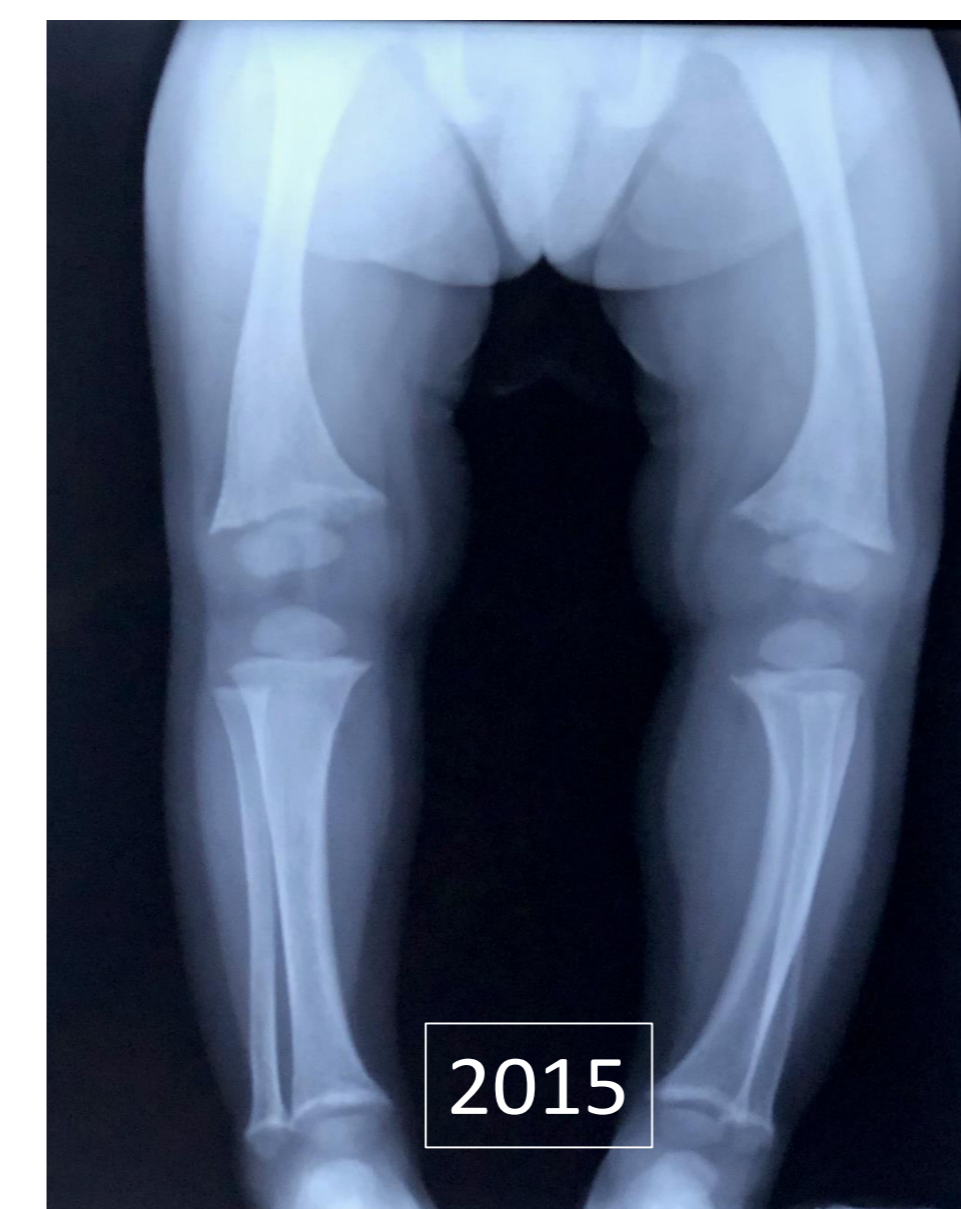
Figure 2 – Lower Limbs XR 3y age

XHR results from mutations in the in the PHEX gene (Phosphate Regulatory Gene with Homology for Endopeptidases located on the X chromosome) located at Xp22.1. PHEX gene has 22 exons and is expressed mainly in the cell membrane of bones and teeth. Currently, at least 364 mutations have been identified, and are registered in the Human Gene Mutation Database.