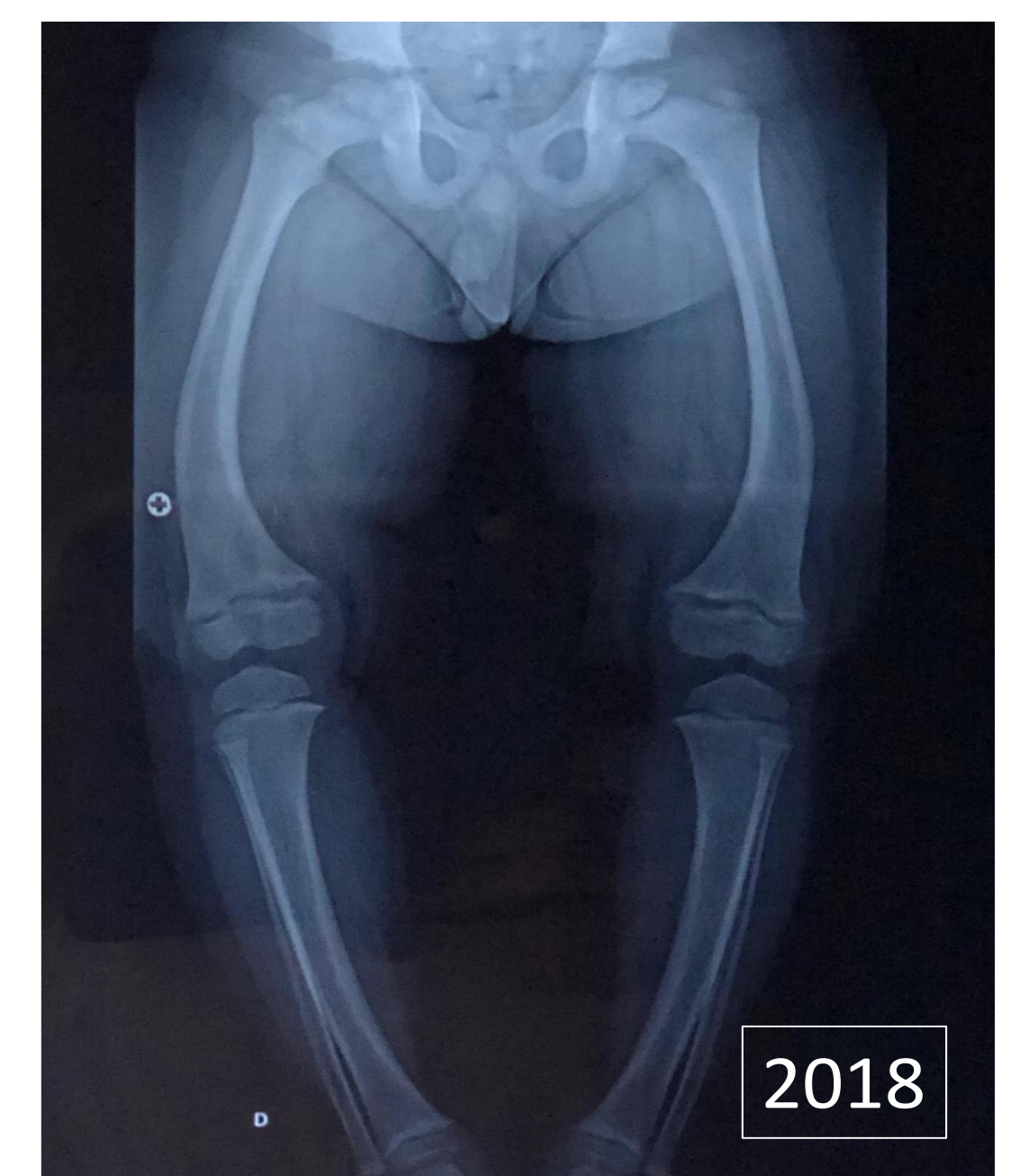
Figure 3 – lower Limbs XR 5y age