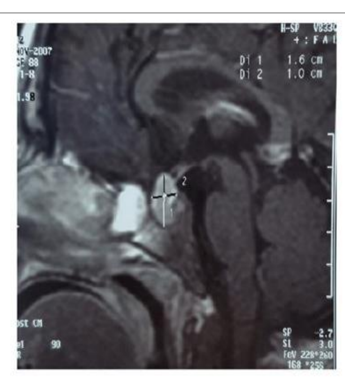
Fig 1: Initial MRI of the pituitry gland. Post enhanced T1 weighted sagittal MRI shows marked enlargement of the pituitary gland that extends slightly into the suprasellar region, with homogeneous enhancement

Repeat laboratory tests 6 months later showed normalisation of TSH and pituitary MRI 10 months after thyroid replacement therapy, showed a reduction in the size of the gland (fig2).