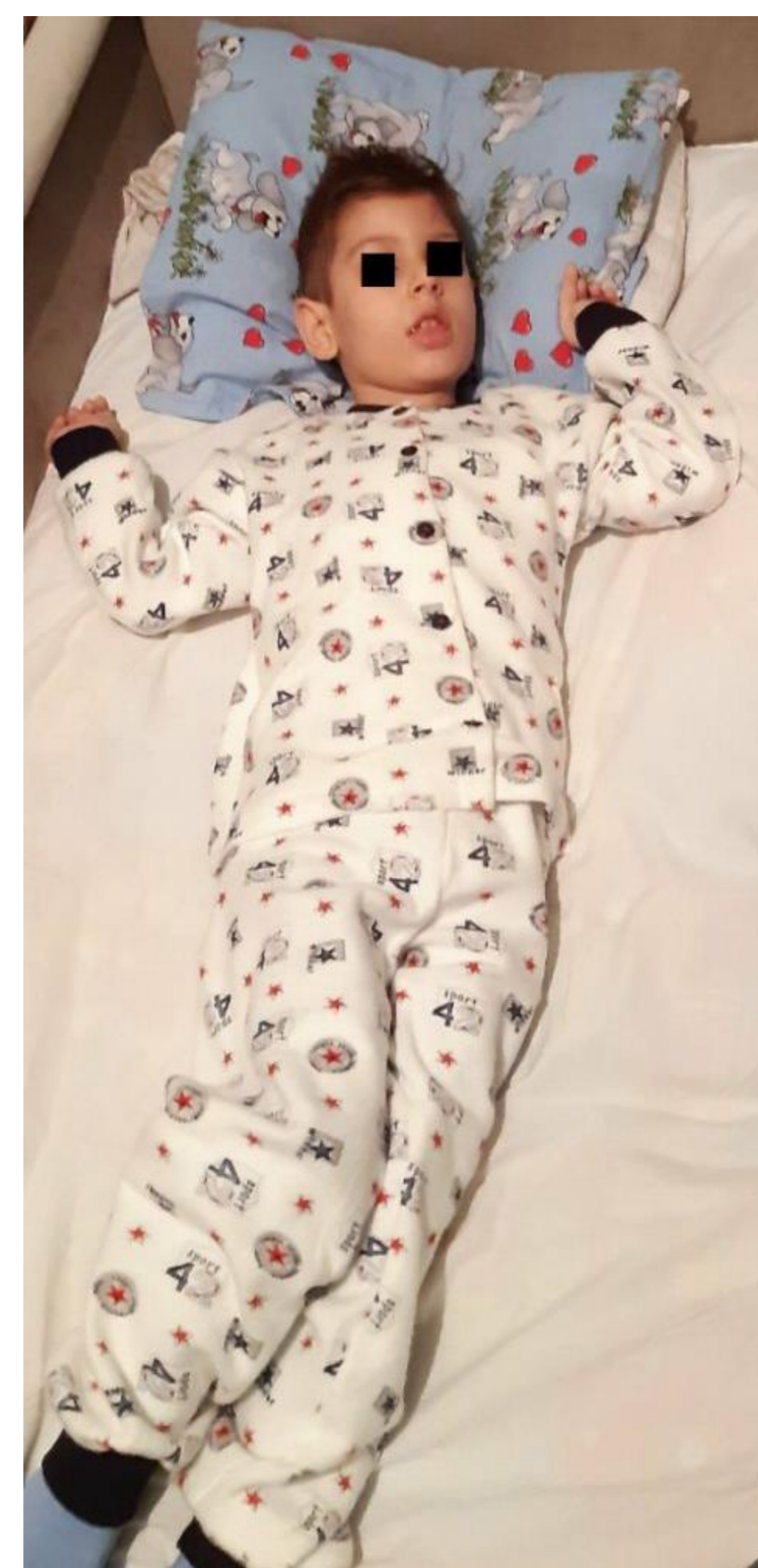
Figure 1: The patient at age of 5 years. Muscular weakness, dystonic opened mouth, no contractures can be seen.

A child was followed by neurologists from the newborn period due to neuro-developmental delay. Newborn screening of TSH was normal, later TSH and fT4 evaluation found subclinical hypothyroidism. Due to stable subclinical hypothyroidism treatment with levothyroxin was administered, which was ineffective and the treatment was stopped. Objective examination showed muscular weakness, scoliosis, global development delay, dystonic opened mouth, no contractures. (Figure 1, Figure 2). The whole-exome-sequencing was performed by neurologists, which revealed a novel homozygous mutation (c.972G>A) in the SLC16A2/MCT8 gene. Last examination: bilateral esotropia, severe tetraparesis with contractures, neuro-developmental delay, no speech, weight - < 3%, height - 25%, head circumference - <3%. Thyroid status and results of Holter-monitoring are shown in Table 1 and Table 2 respectively. Symptoms of peripheral hyperthyroidism: tachycardia 115-197b/min by Holter-monitoring.