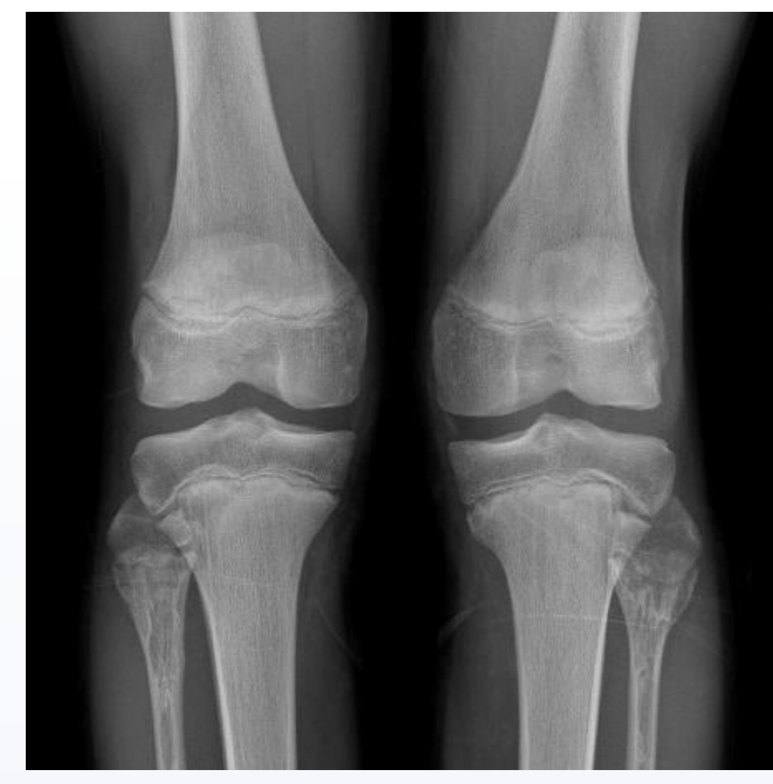
Figure 3: Spinal radiograph and radiograph of the knee and hip of her older brother showing similar metaphyseal and vertebral body changes as the patient