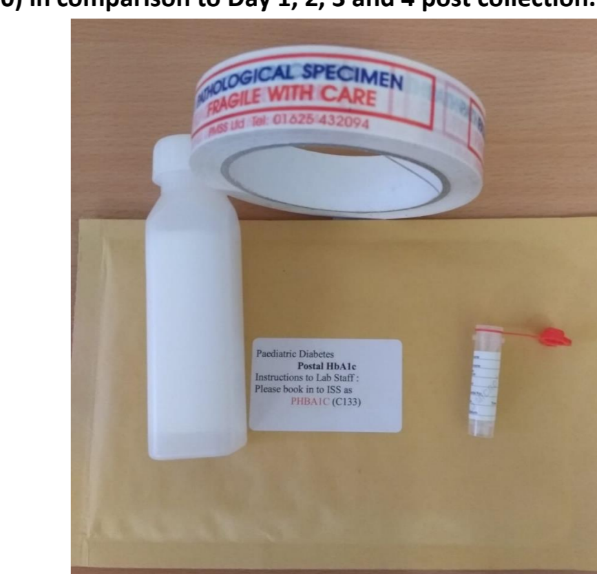
Figure 3: Example packaging given to the patient to collect and post the sample back to the laboratory.