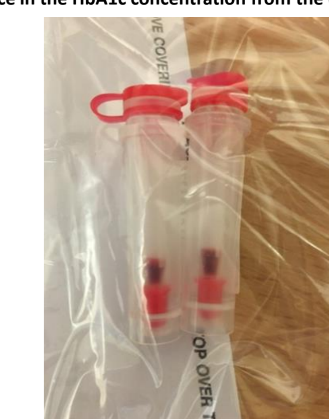
Figure 2: Sarstedt Microvette 300 EDTA tube with collected capillary blood inside a Pathology specimen bag.