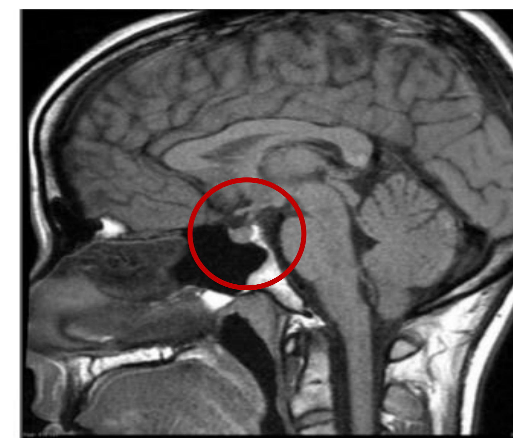
Figure 1. Normal pituitary area.

The family genetic study revealed that the father of both is a carrier of the pathogenic mutation .