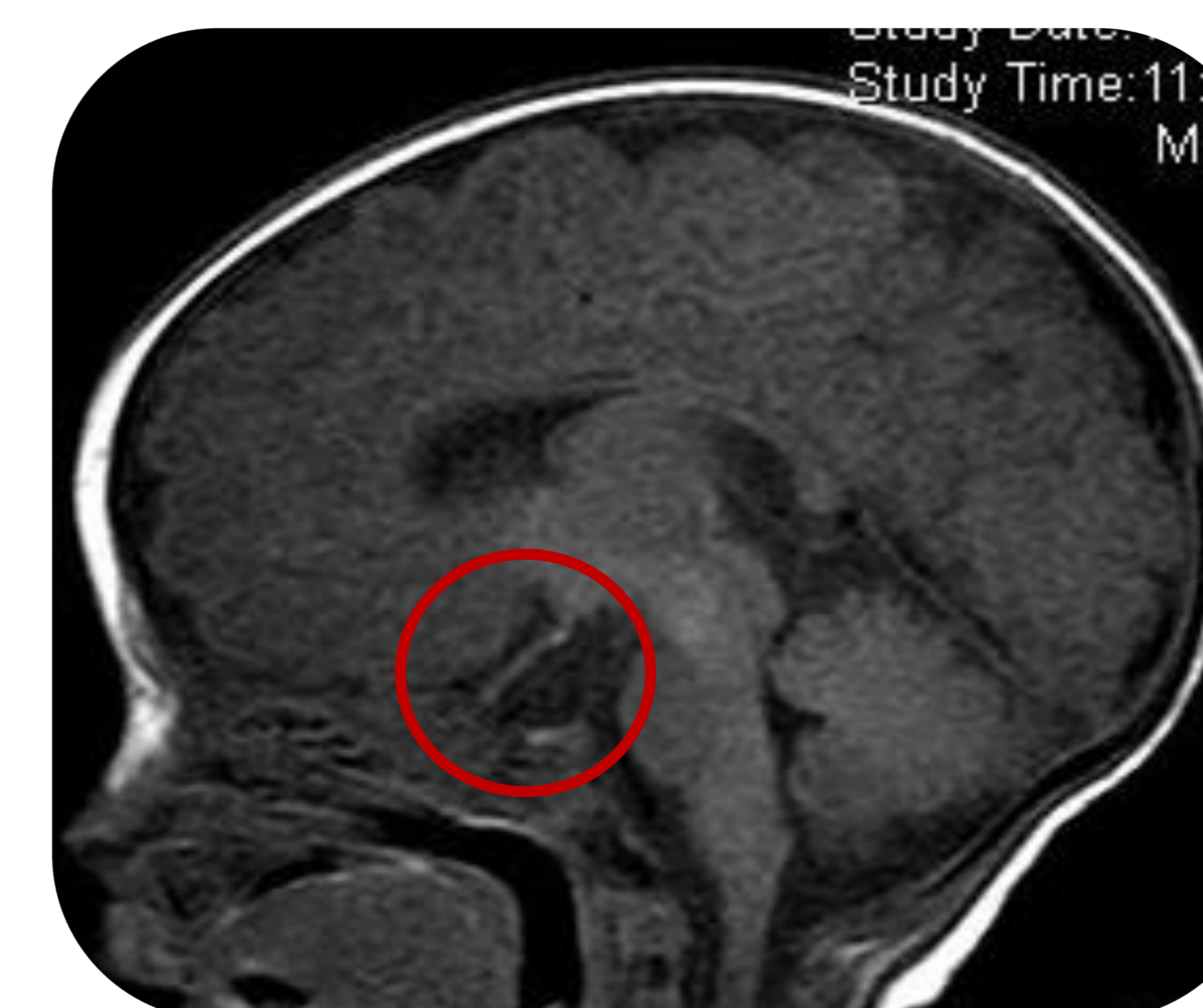
Figure 2. Structural alteration of the pituitary area: pituitary hypoplasia, absence of pituitary stalk and ectopic neurohypophysis.