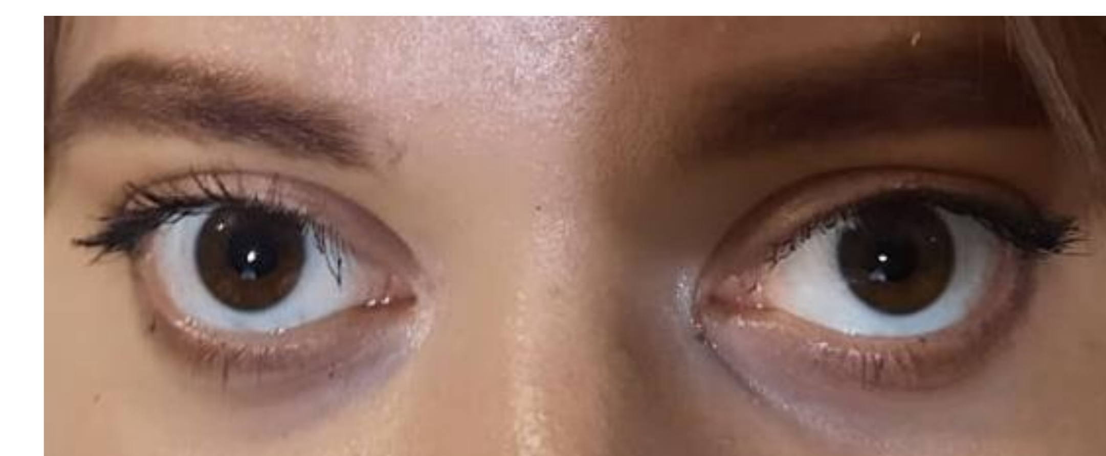
Pic. 1 Before intravenous introduction of glucocorticoids

When performing MR control of orbits (1 month and 9 months after the end of pulse therapy): MR - picture of lipogenic exophthalmos without thickening of the oculomotor muscles. There was a progressive positive dynamics in the form of a decrease in exophthalmos, hydration of retrobulbar fiber. No adverse events were observed.